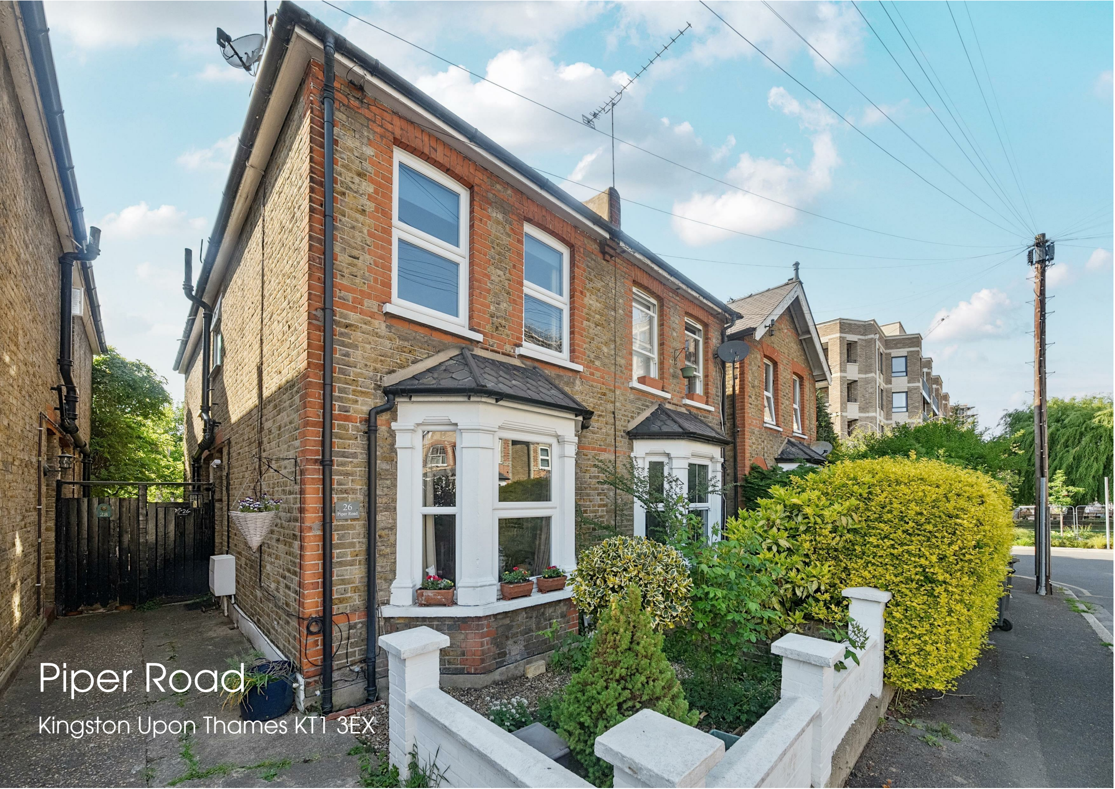
Piper Road Kingston Upon Thames KT1 3EX