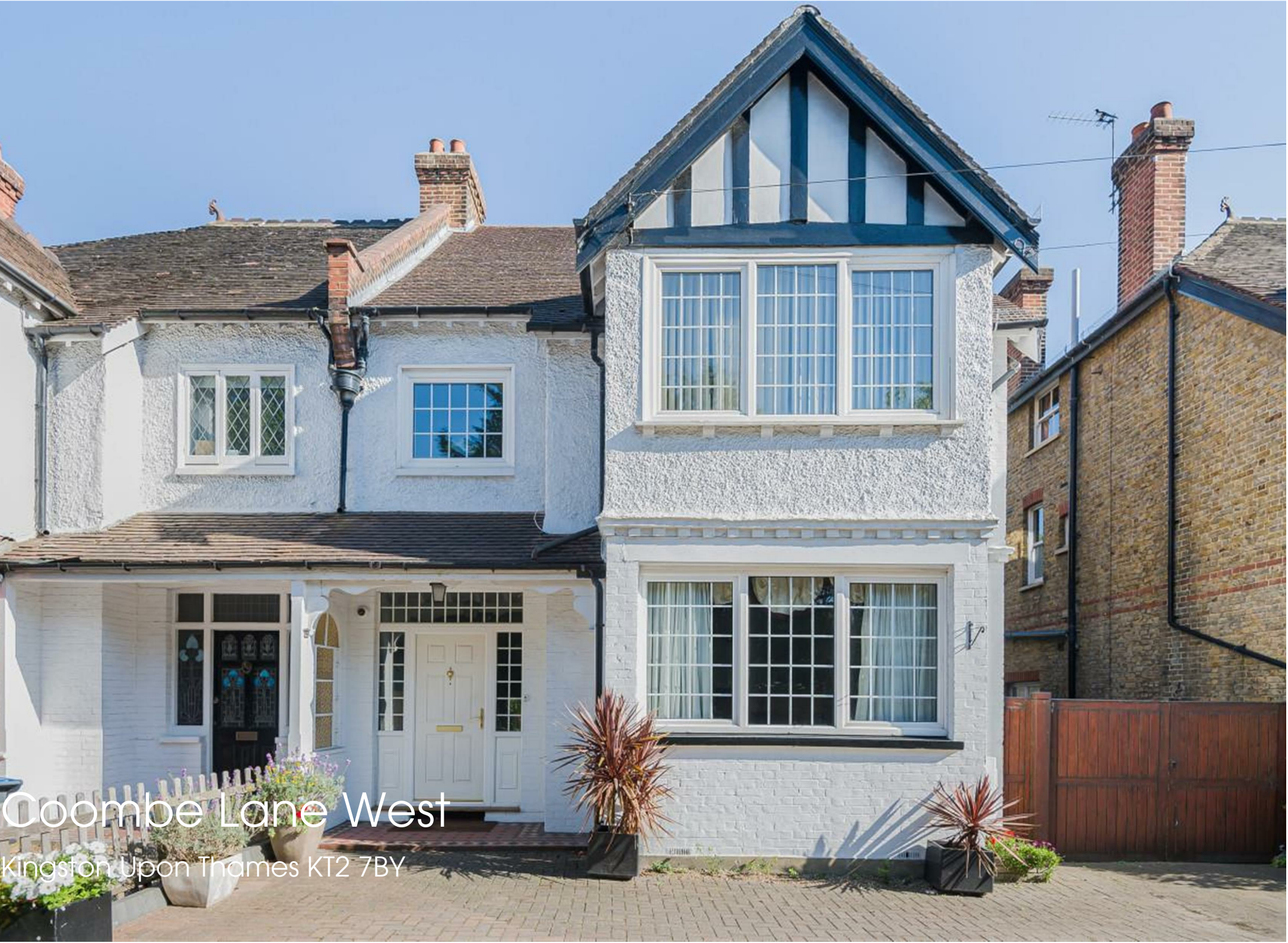
Coombe Lane West Kingston Upon Thames KT2 7BY