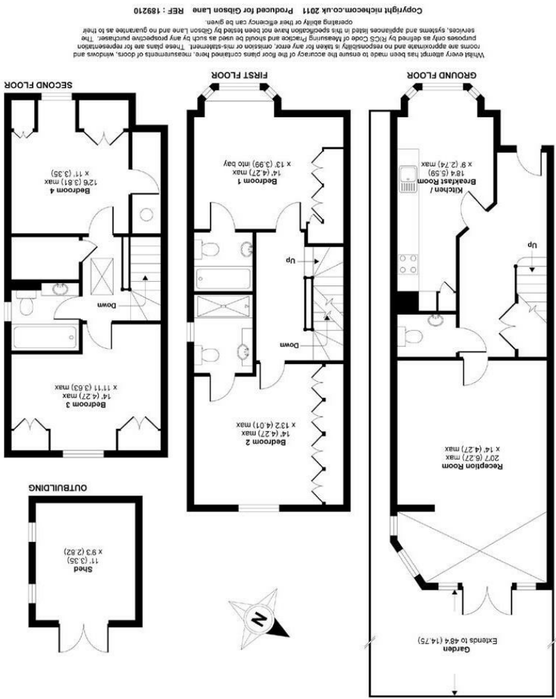
Clifton Road, Kingston Upon Thames, Surrey, KT2 APPROX. GROSS INTERNAL FLOOR AREA 1577 SQ FT 146.5 SQ METRES (Excludes Outbuilding)

34 Richmond Road Kingston upon Thames Surrey KT2 5ED www.gibsonlane.co.uk Tel: 020 8546 5444