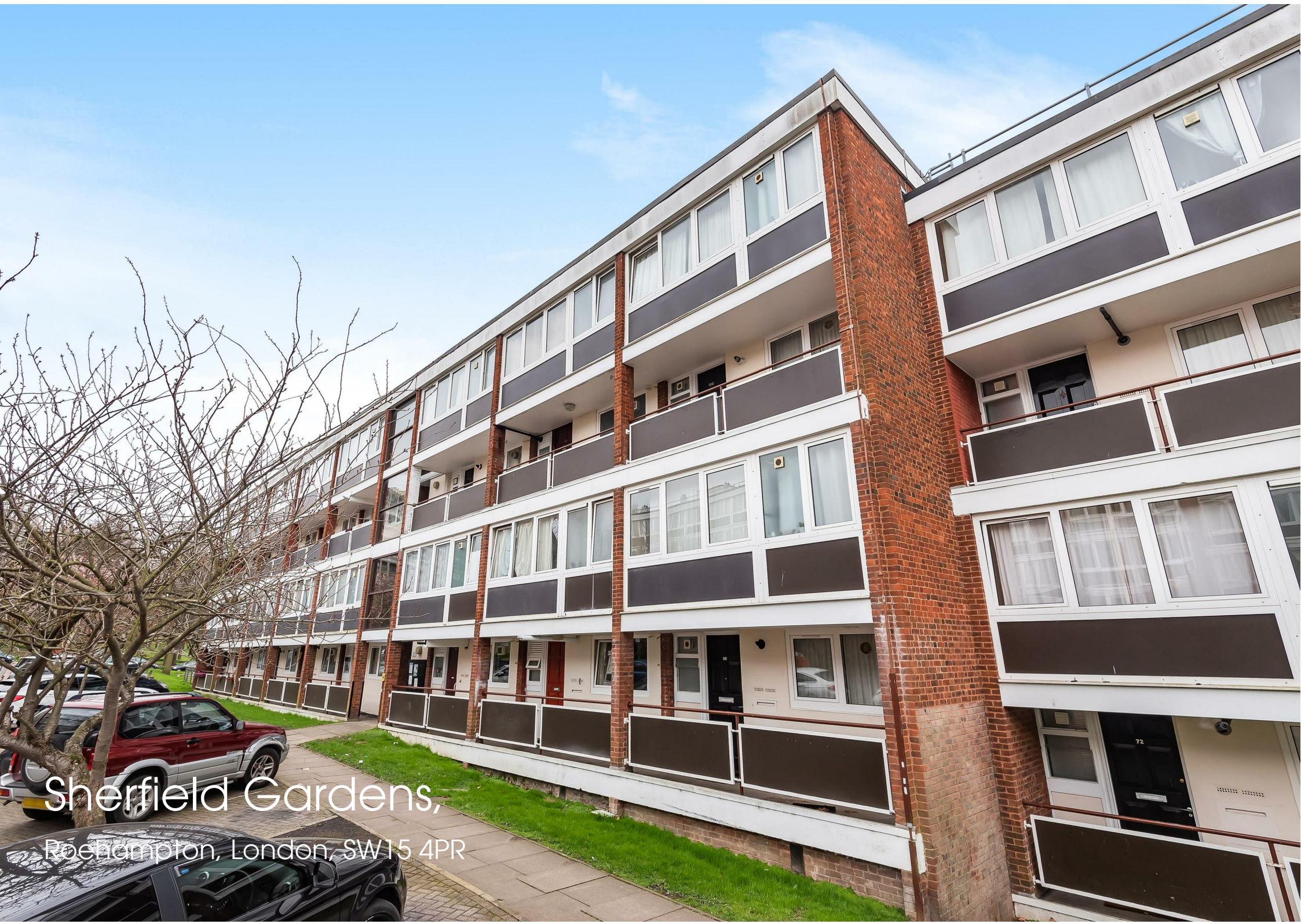
Sherfield Gardens, Richmond, London, SW15 4PR

gibson lane 34 Richmond Road Kingston upon Thames Surrey KT2 5ED www.gibsonlane.co.uk Tel: 020 8546 5444