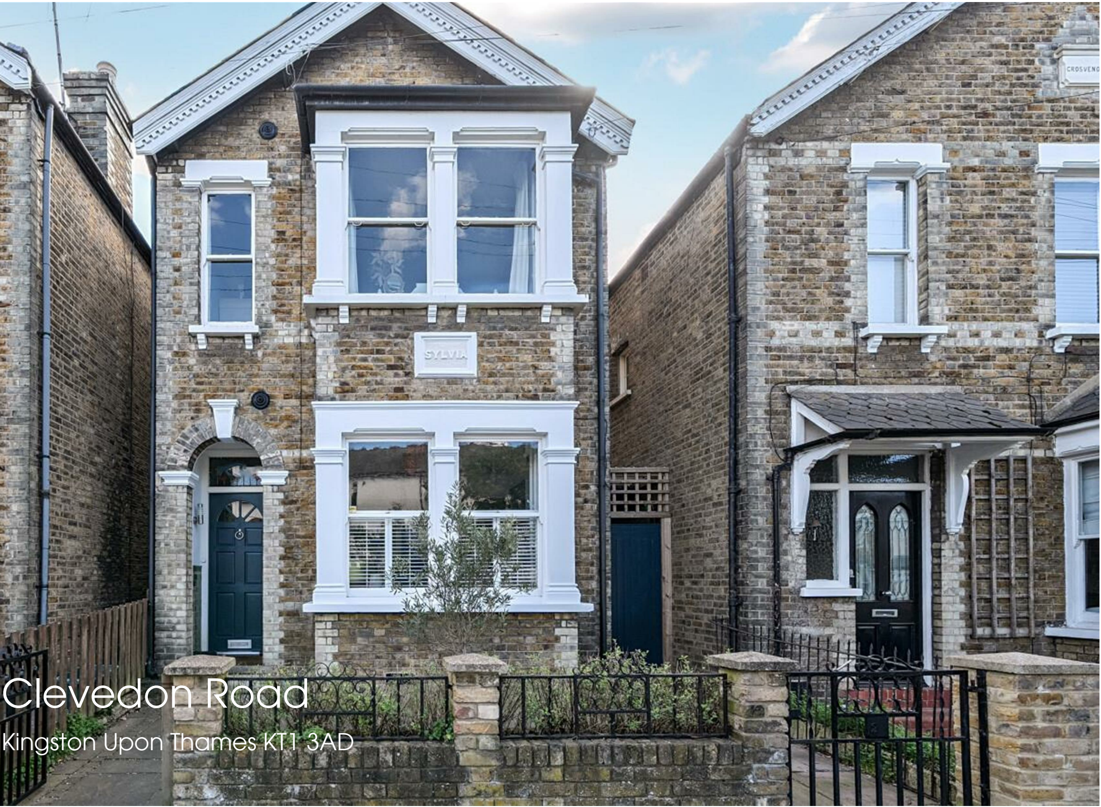
Clevedon Road Kingston Upon Thames KT1 3AD