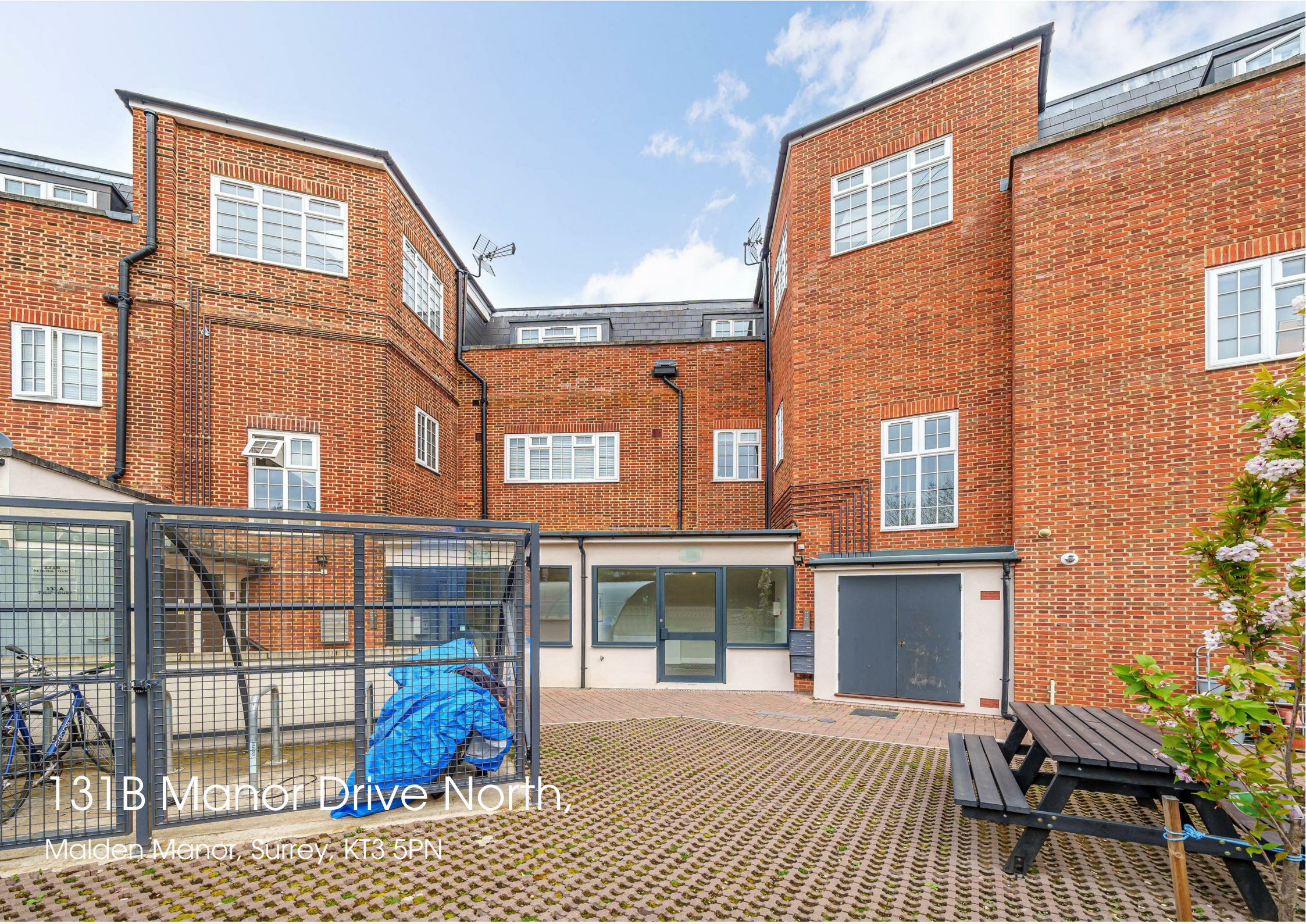
131B Manor Drive North, Malden Manor, Surrey, KT3 5PN