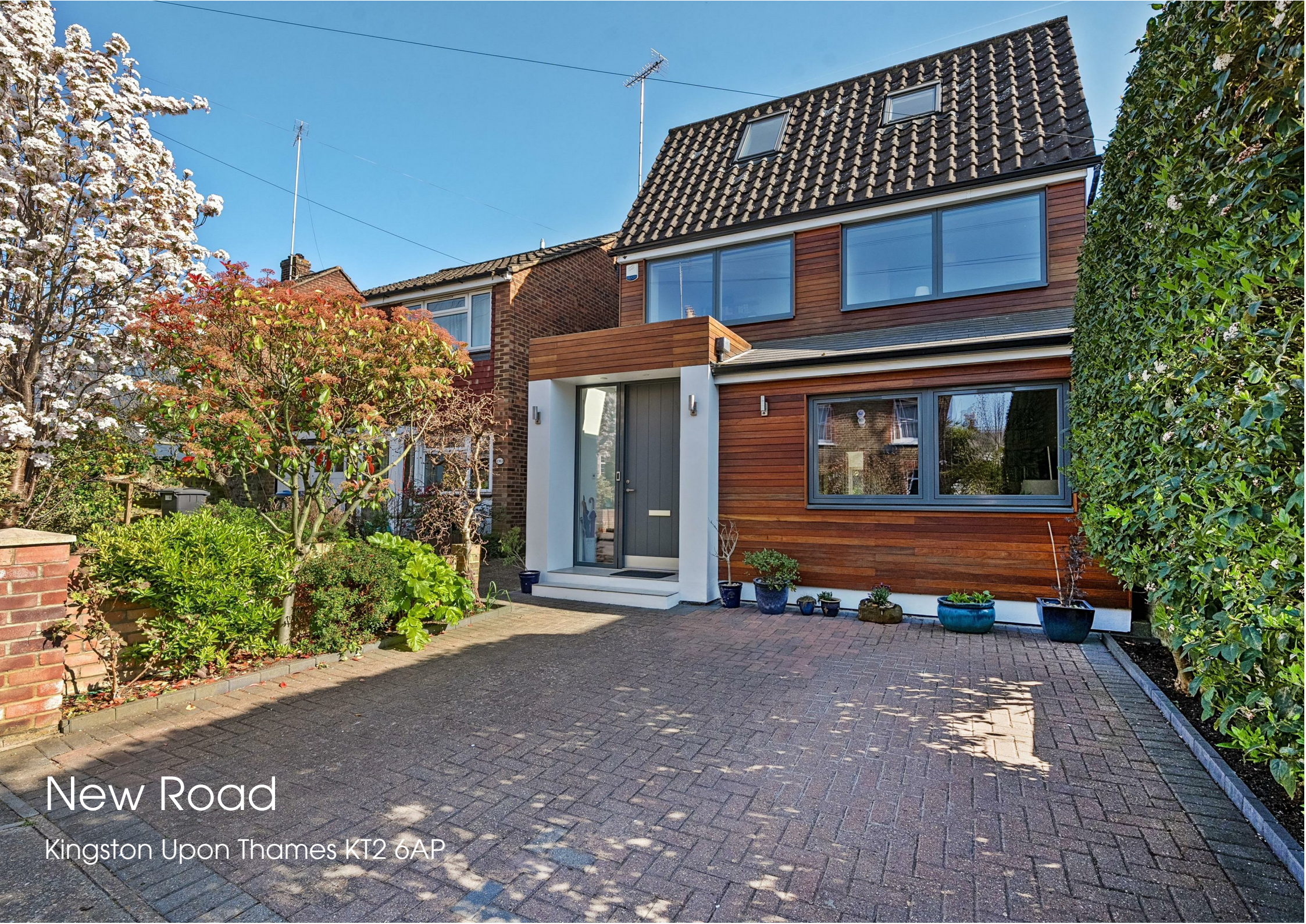
New Road Kingston Upon Thames KT2 6AP