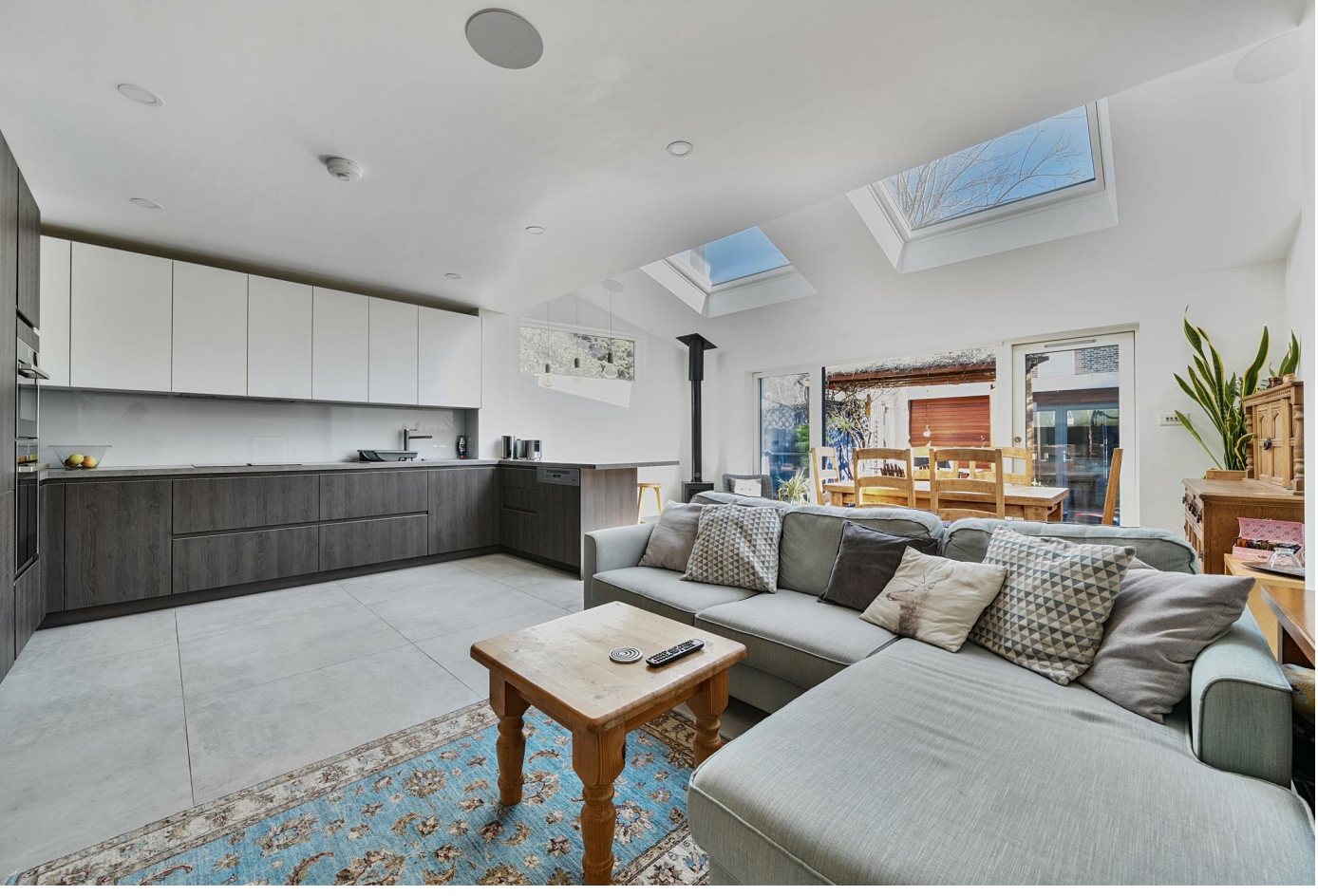
Guide Price £1,350,000