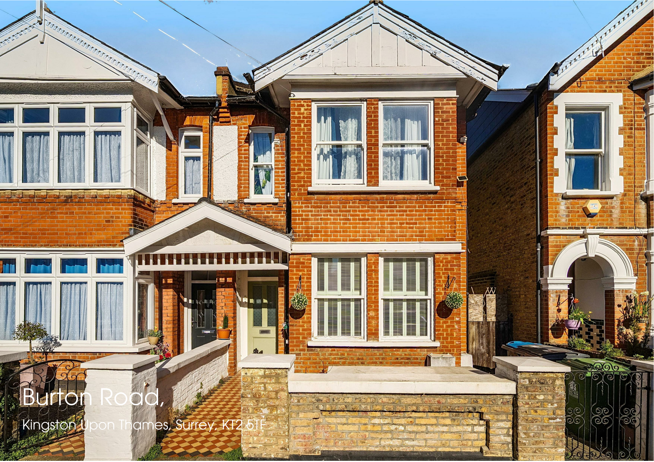
Burton Road, Kingston Upon Thames, Surrey, KT2 5TE