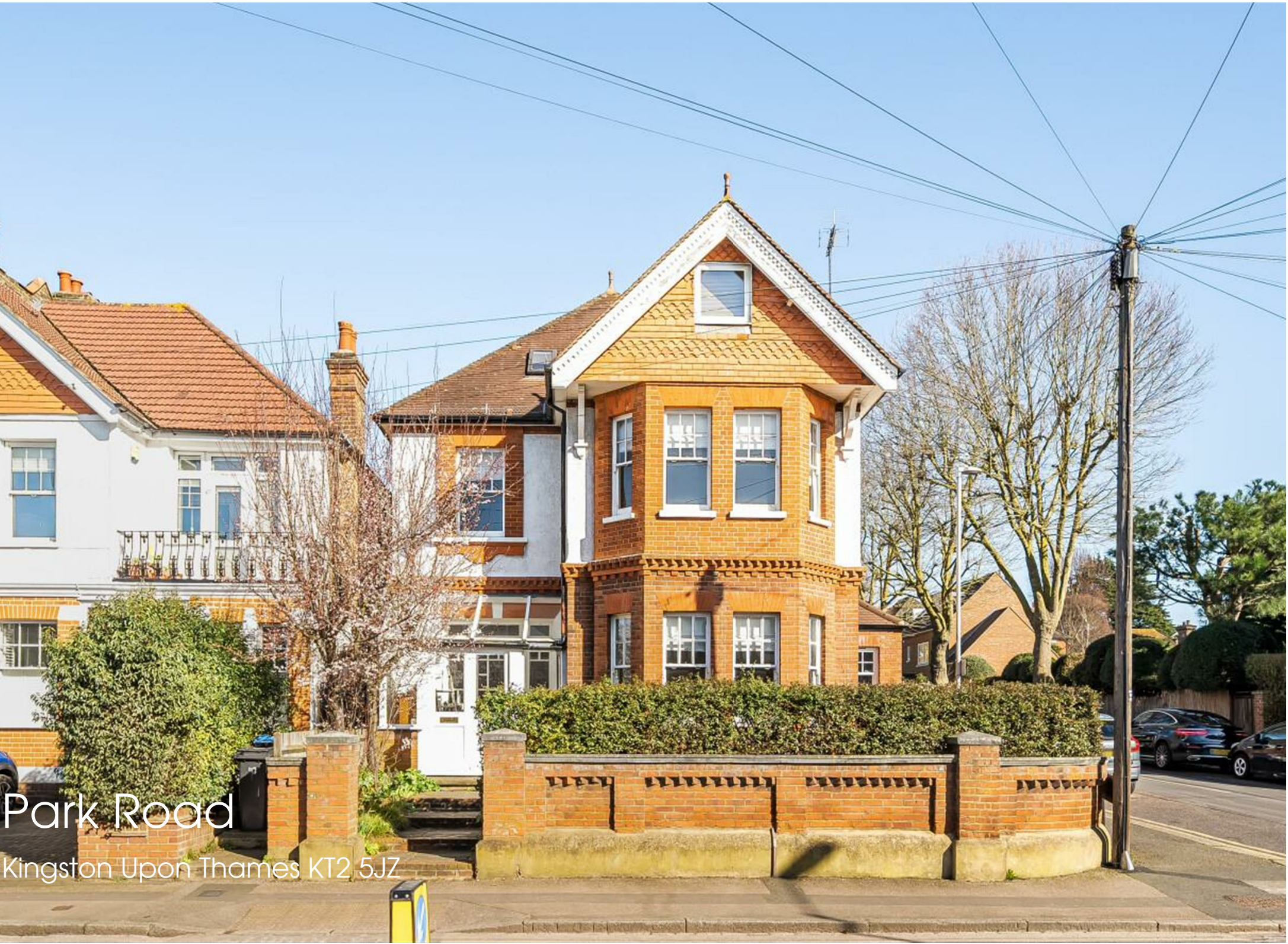
Park Road Kingston Upon Thames KT2 5JZ