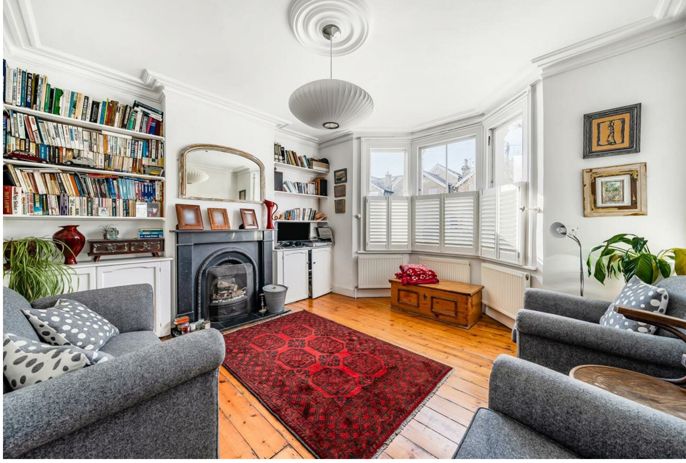
Guide Price £1,225,000