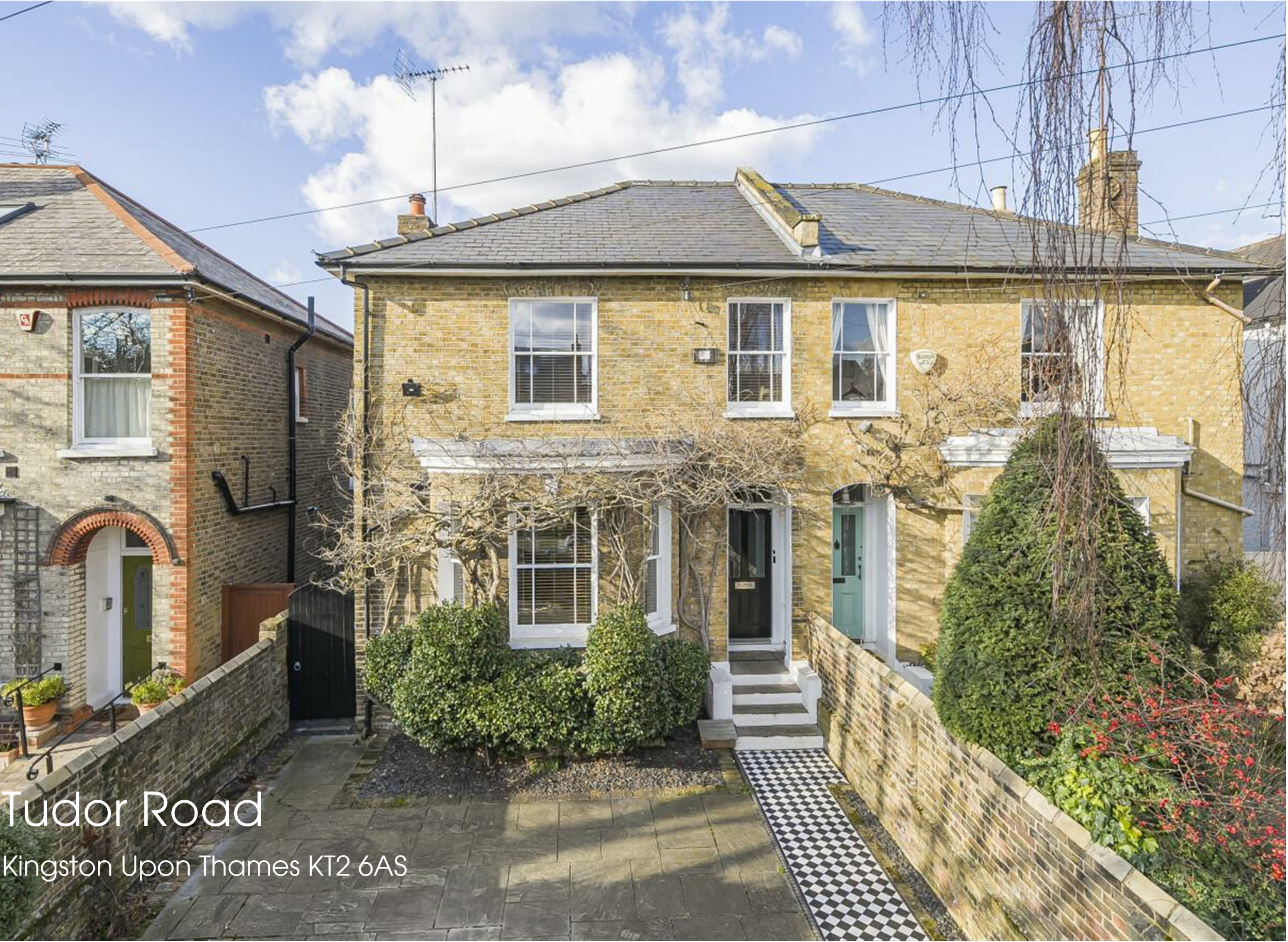
Tudor Road Kingston Upon Thames KT2 6AS