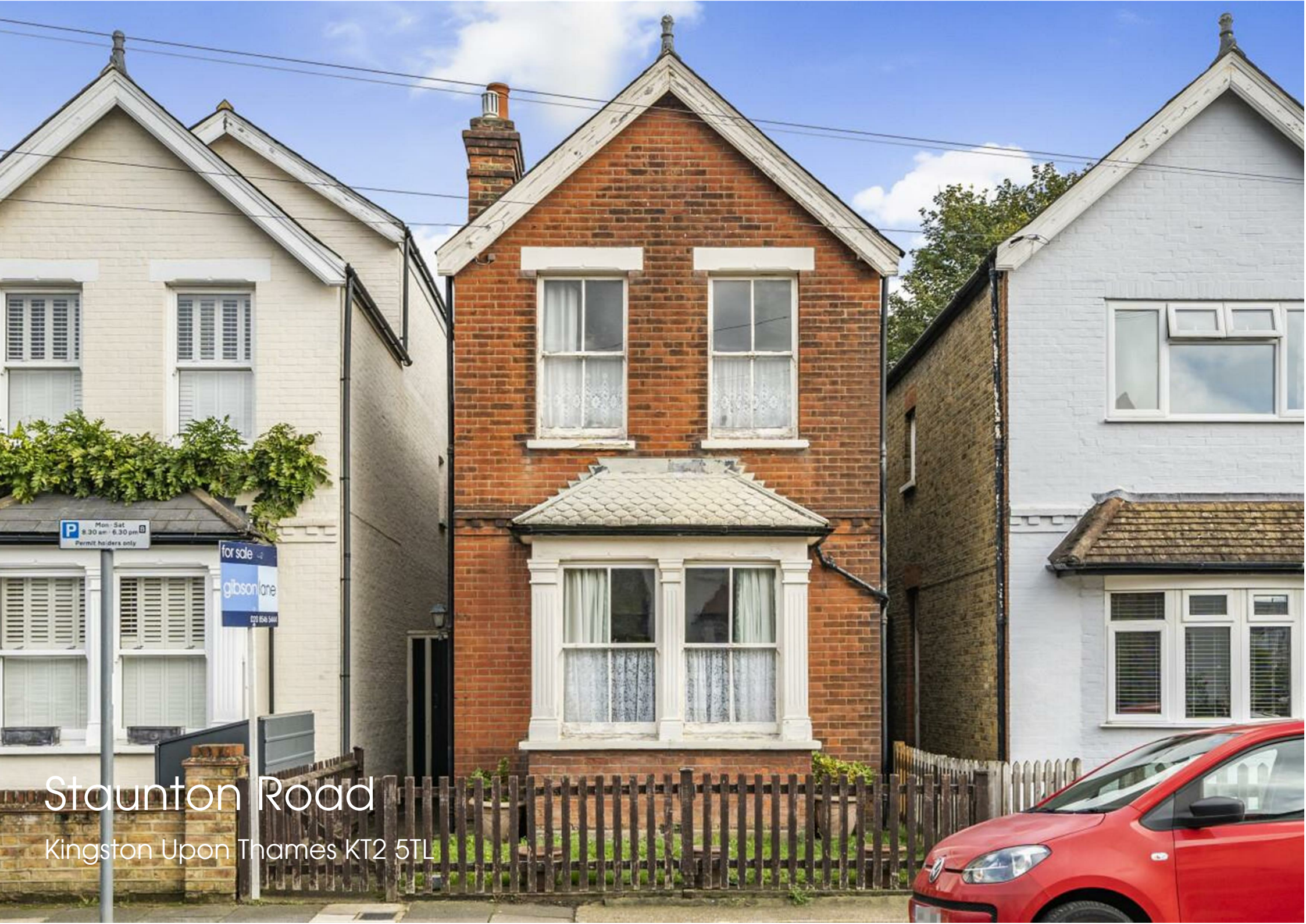
Staunton Road Kingston Upon Thames KT2 5TL