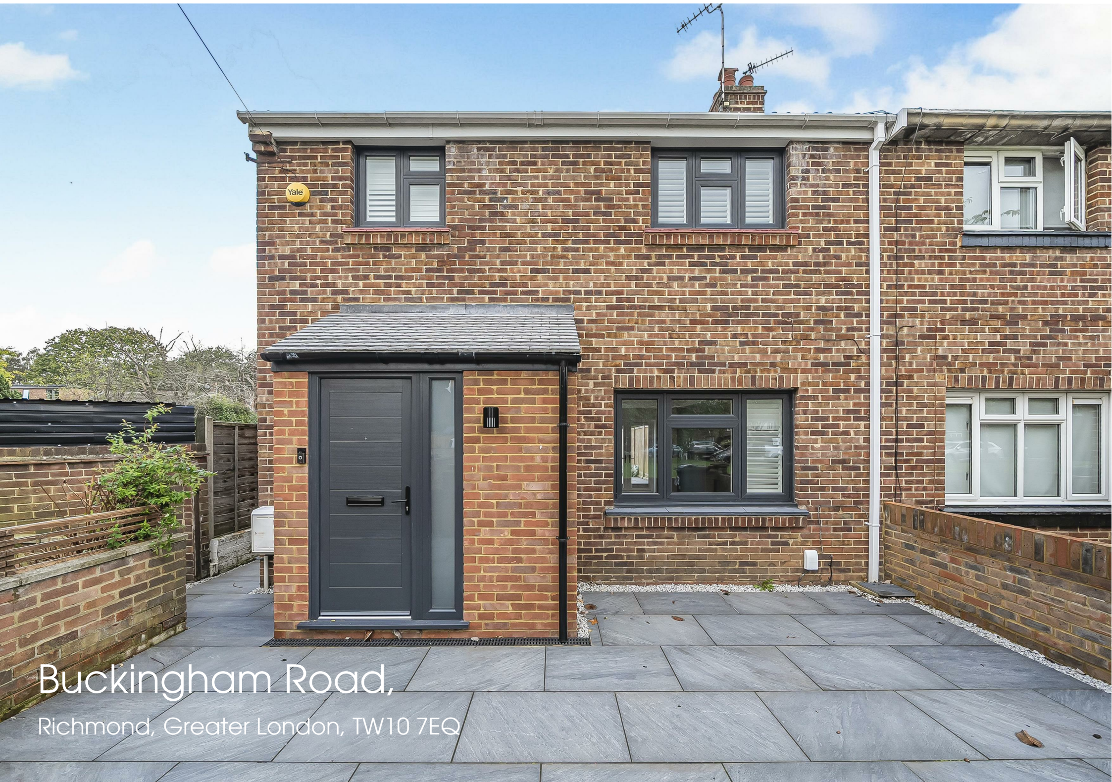
Buckingham Road, Richmond, Greater London, TW10 7EQ

34 Richmond Road Kingston upon Thames Surrey KT2 5ED www.gibsonlane.co.uk Tel: 020 8546 5444