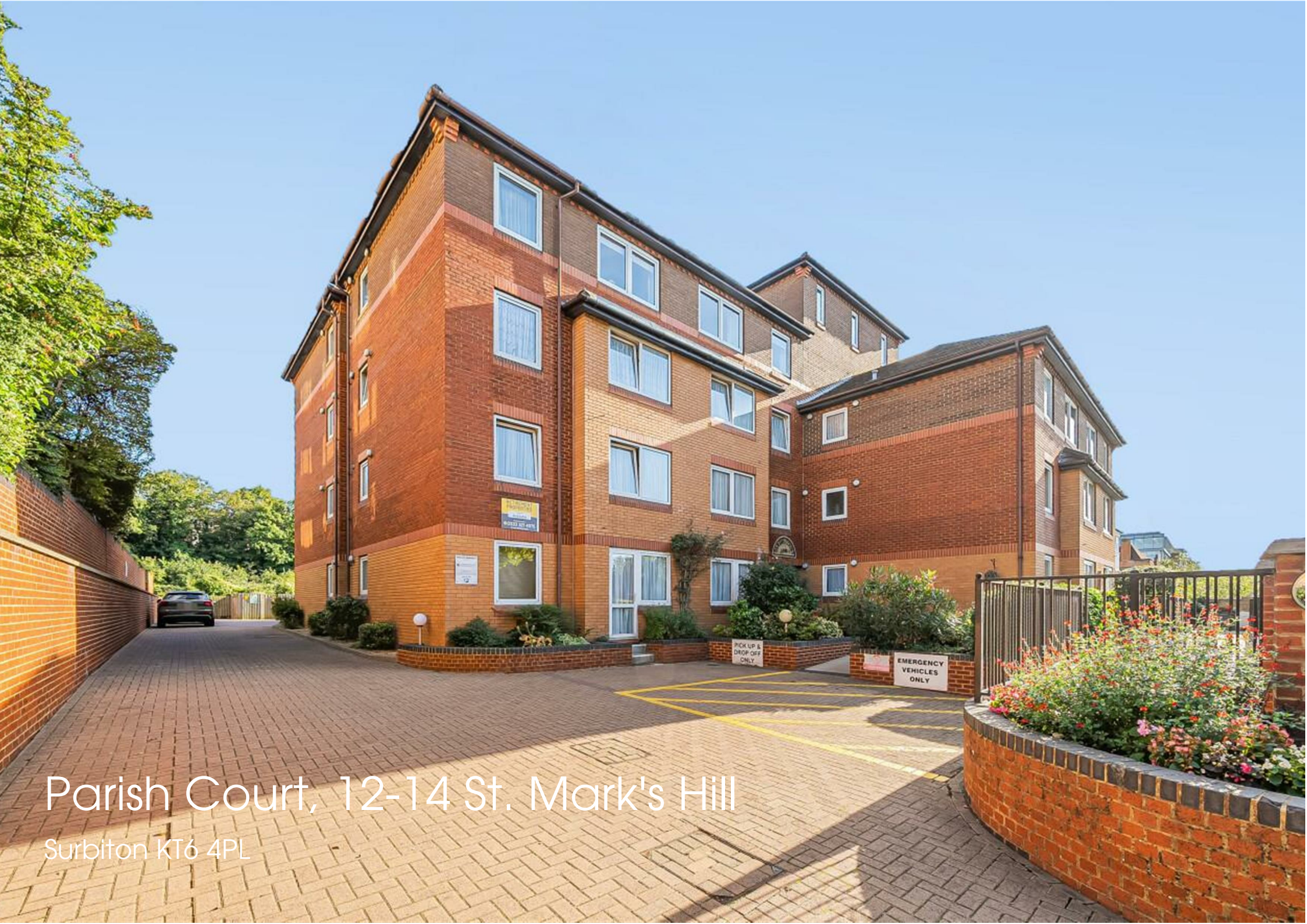
Parish Court, 12-14 St. Mark's Hill Surbiton KT6 4PL