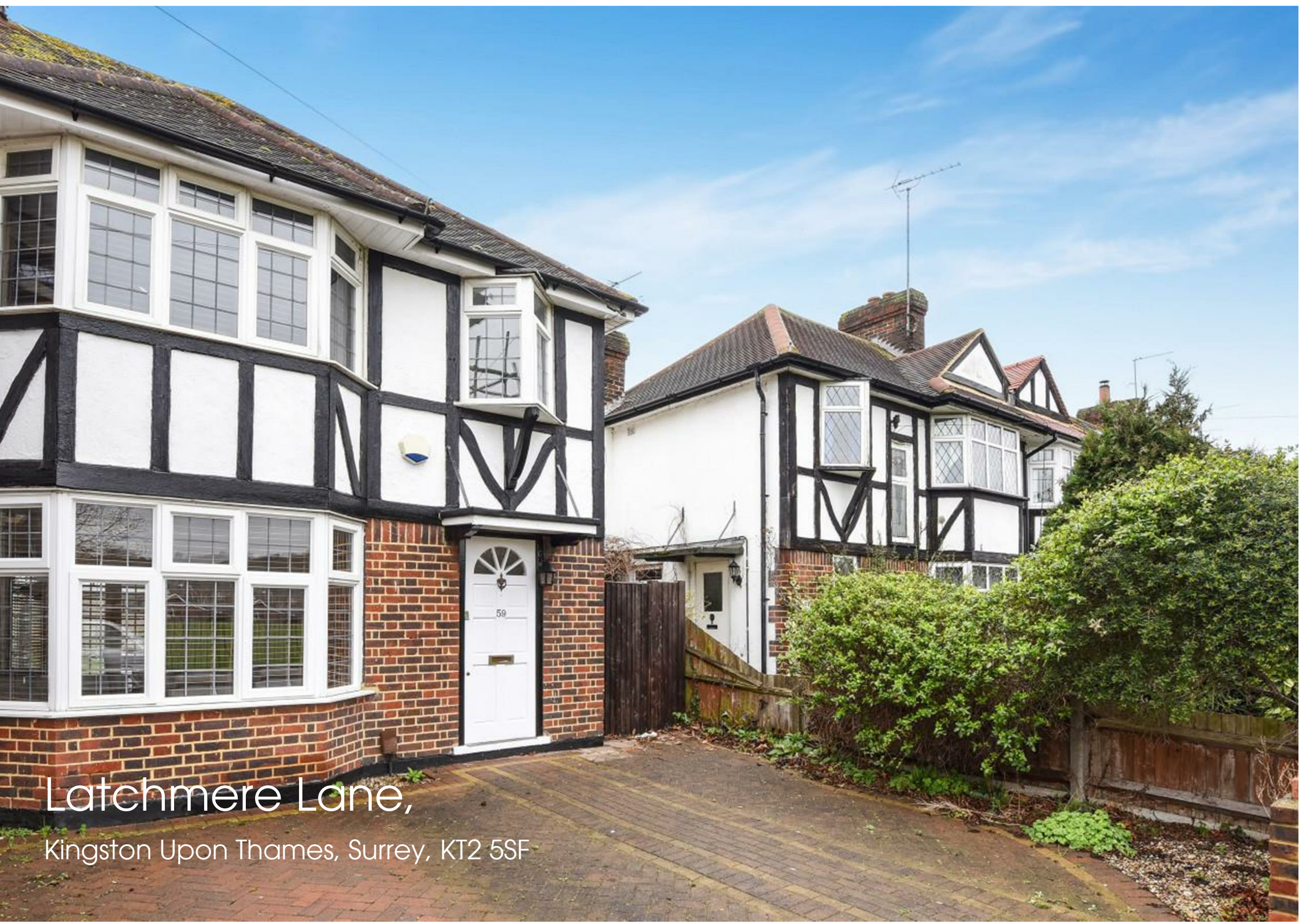
Latchmere Lane, Kingston Upon Thames, Surrey, KT2 5SF