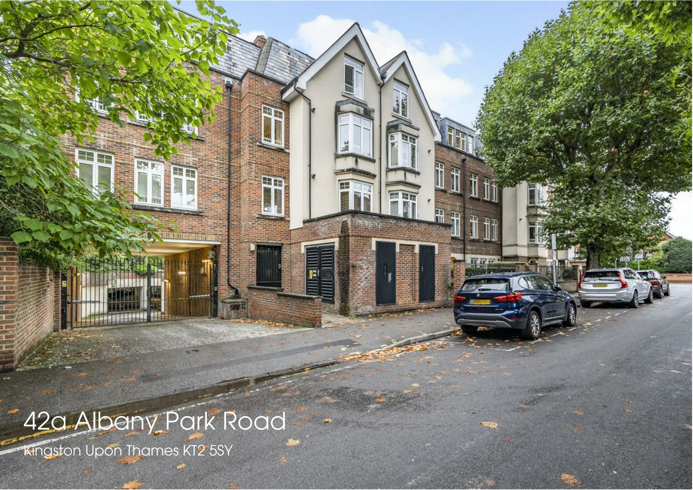
42a Albany Park Road Kingston upon Thames KT2 5SY