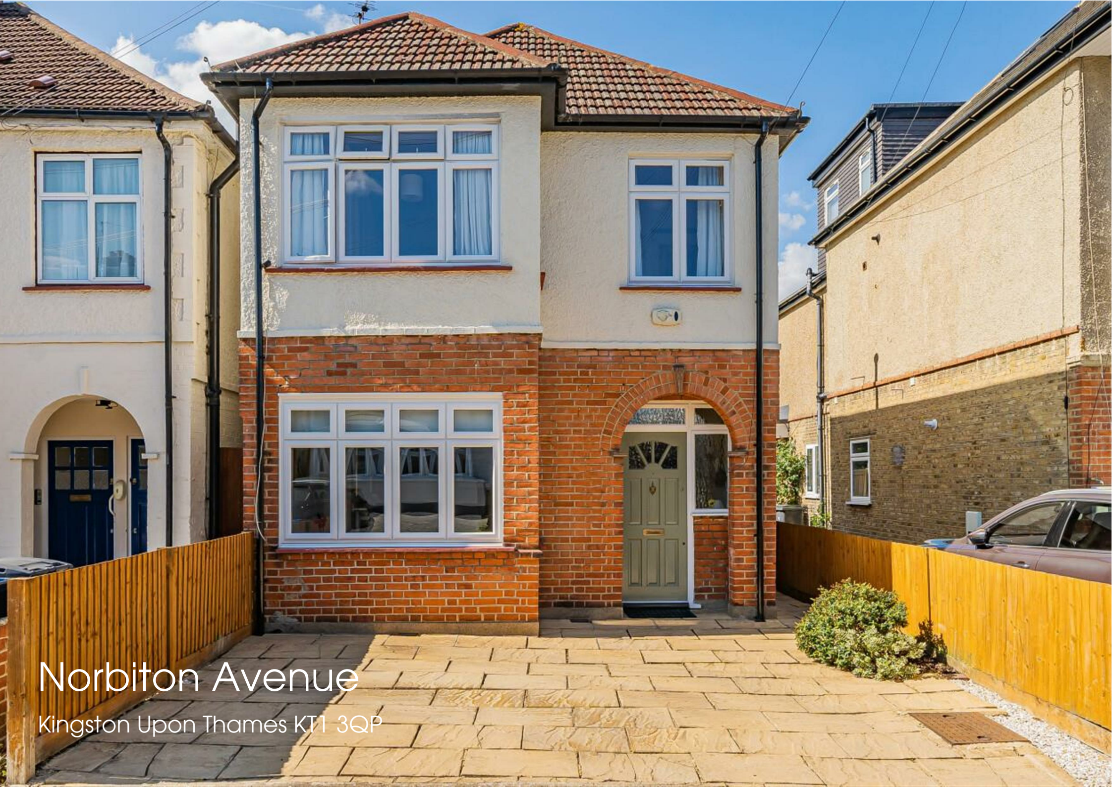
Norbiton Avenue Kingston Upon Thames KT1 3QP

34 Richmond Road Kingston upon Thames Surrey KT2 5ED www.gibsonlane.co.uk Tel: 020 8546 5444