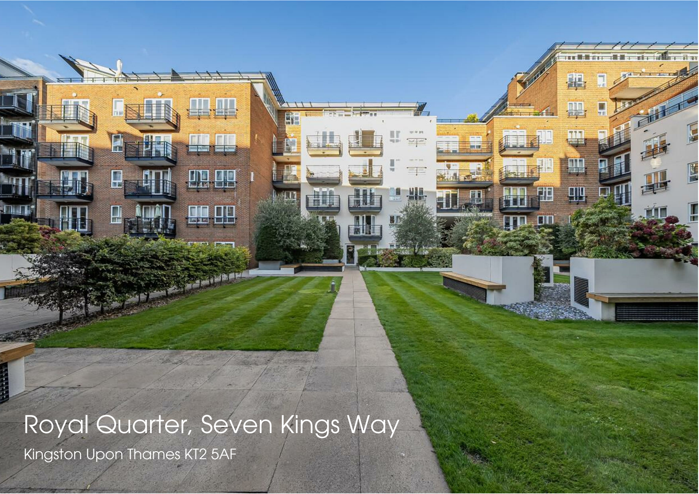
Royal Quarter, Seven Kings Way Kingston Upon Thames KT2 5AF