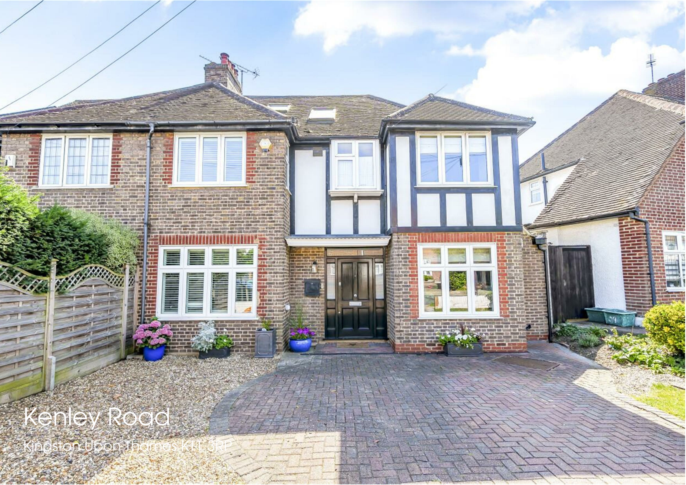
Kenley Road Kingston upon Thames KT1 3RP

34 Richmond Road Kingston upon Thames Surrey KT2 5ED www.gibsonlane.co.uk Tel: 020 8546 5444