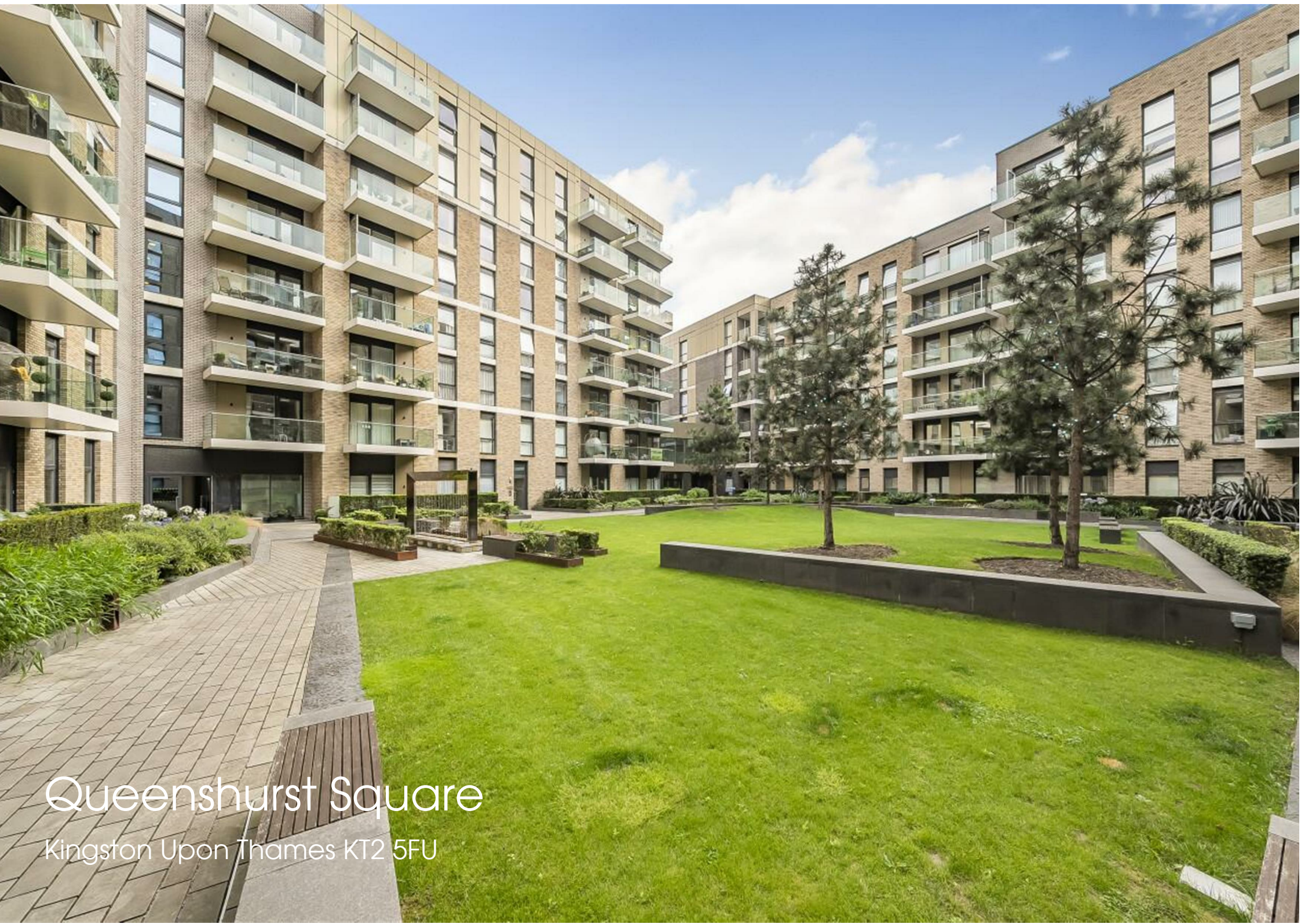
Queenshurst Square Kingston Upon Thames KT2 5FU

34 Richmond Road Kingston upon Thames Surrey KT2 5ED www.gibsonlane.co.uk Tel: 020 8546 5444