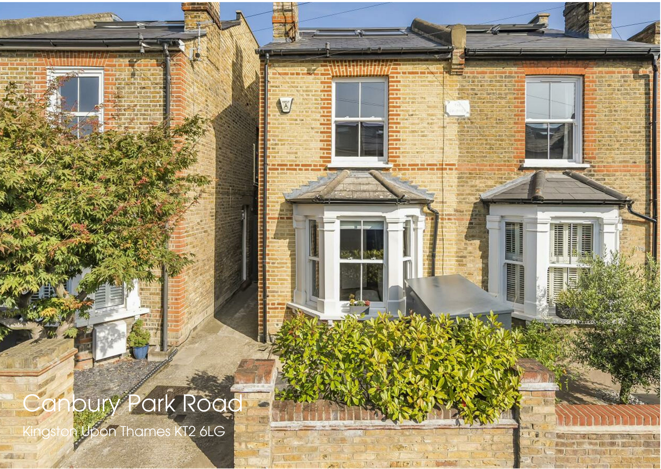
Canbury Park Road Kingston Upon Thames KT2 6LG