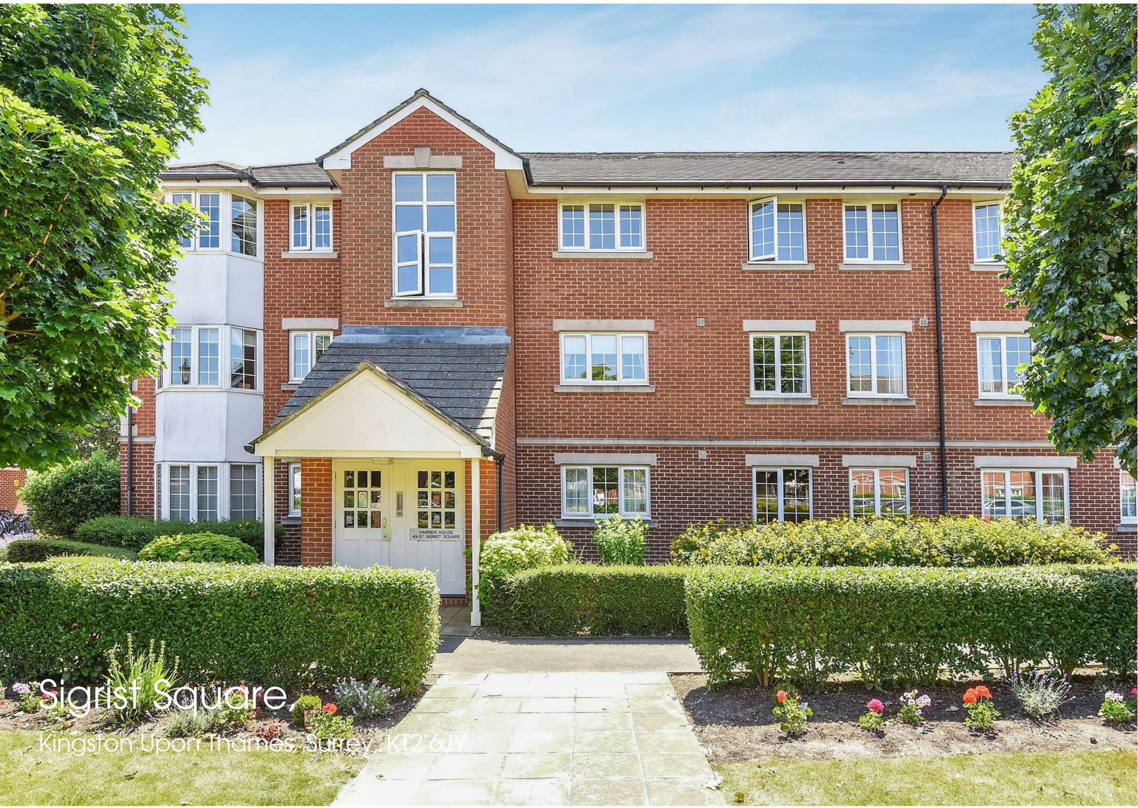
Sigrist Square Kingston Upon Thames, Surrey, KT2 6JY

34 Richmond Road Kingston upon Thames Surrey KT2 5ED www.gibsonlane.co.uk Tel: 020 8546 5444