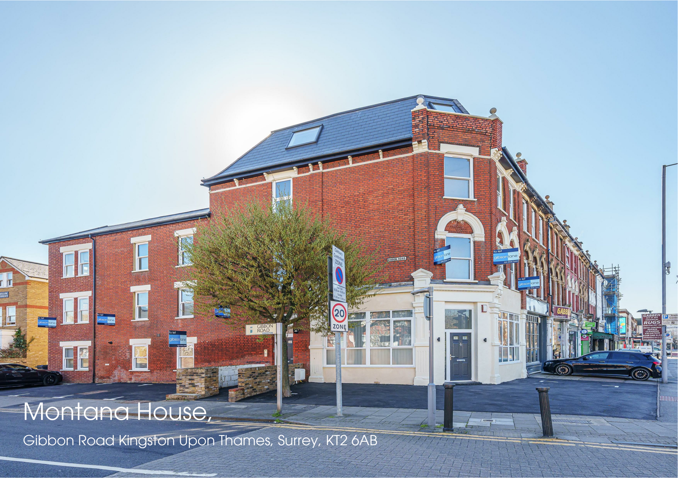
Montana House, Gibbon Road Kingston Upon Thames, Surrey, KT2 6AB