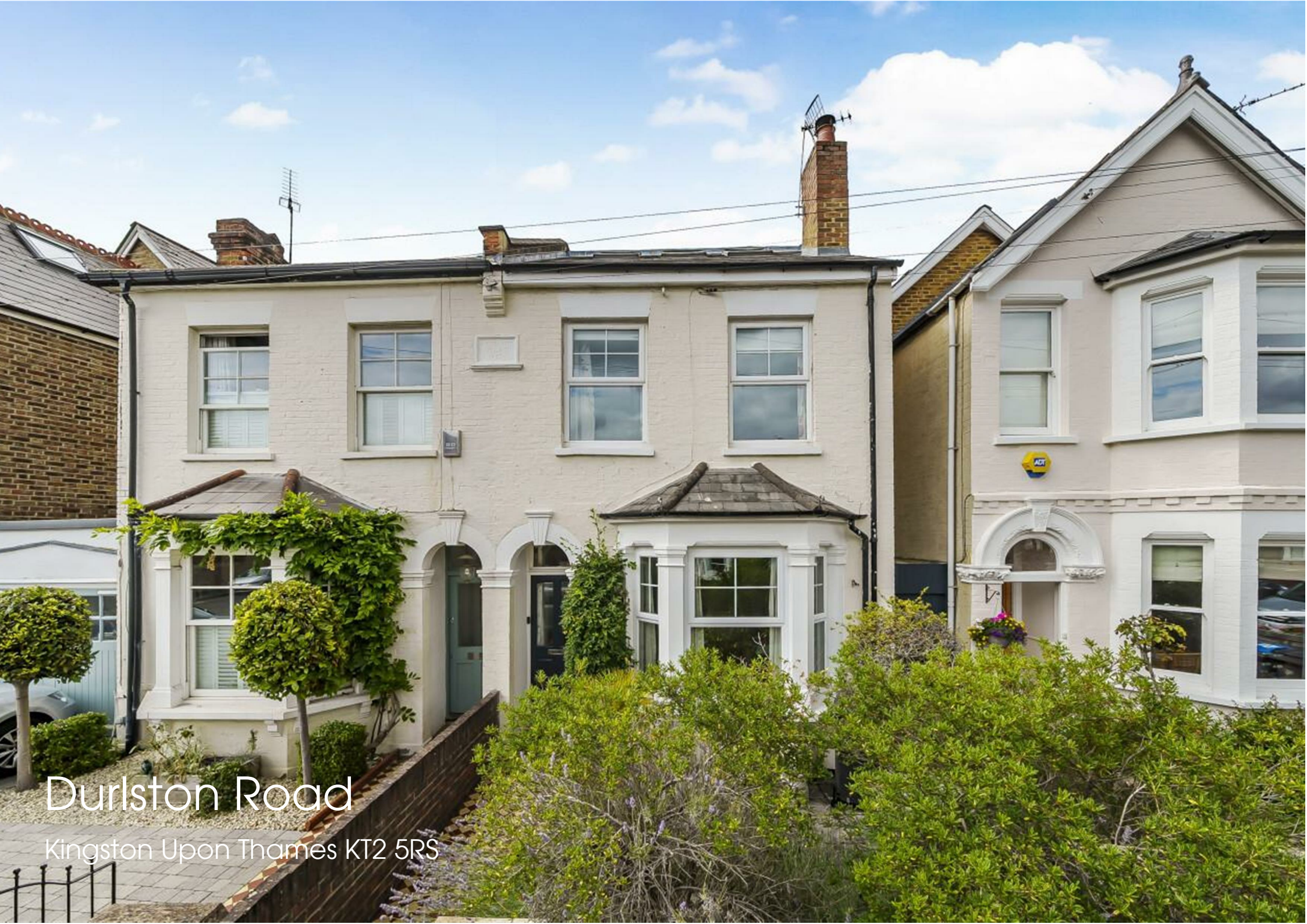
Durlston Road Kingston Upon Thames KT2 5RS

34 Richmond Road Kingston upon Thames Surrey KT2 5ED www.gibsonlane.co.uk Tel: 020 8546 5444