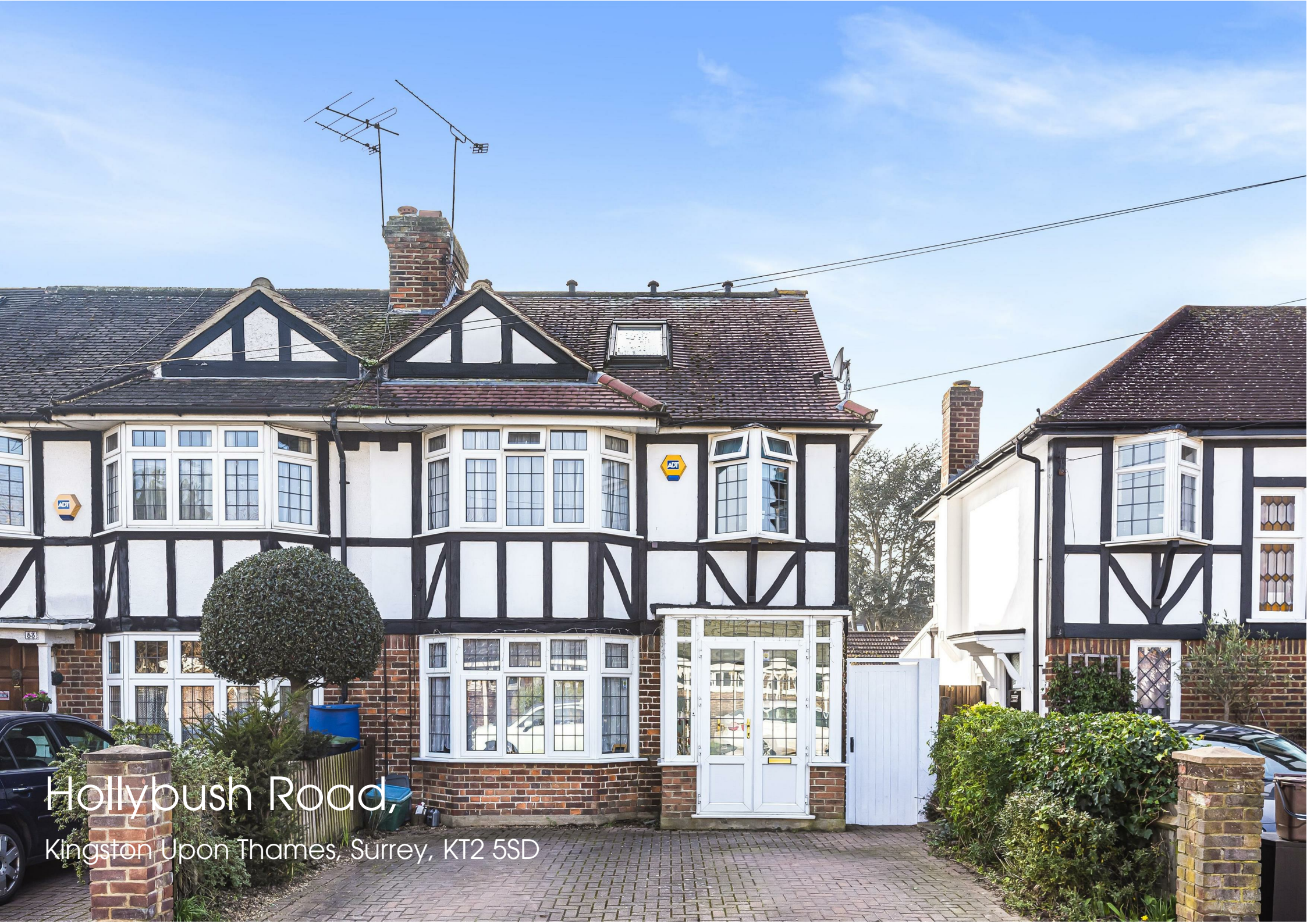
Hollybush Road, Kingston Upon Thames, Surrey, KT2 5SD

34 Richmond Road Kingston upon Thames Surrey KT2 5ED www.gibsonlane.co.uk Tel: 020 8546 5444