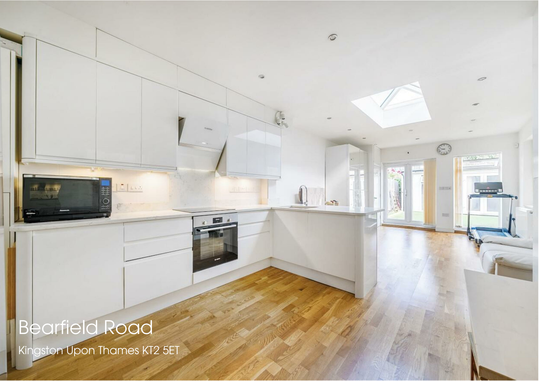
Bearfield Road Kingston Upon Thames KT2 5ET

34 Richmond Road Kingston upon Thames Surrey KT2 5ED www.gibsonlane.co.uk Tel: 020 8546 5444