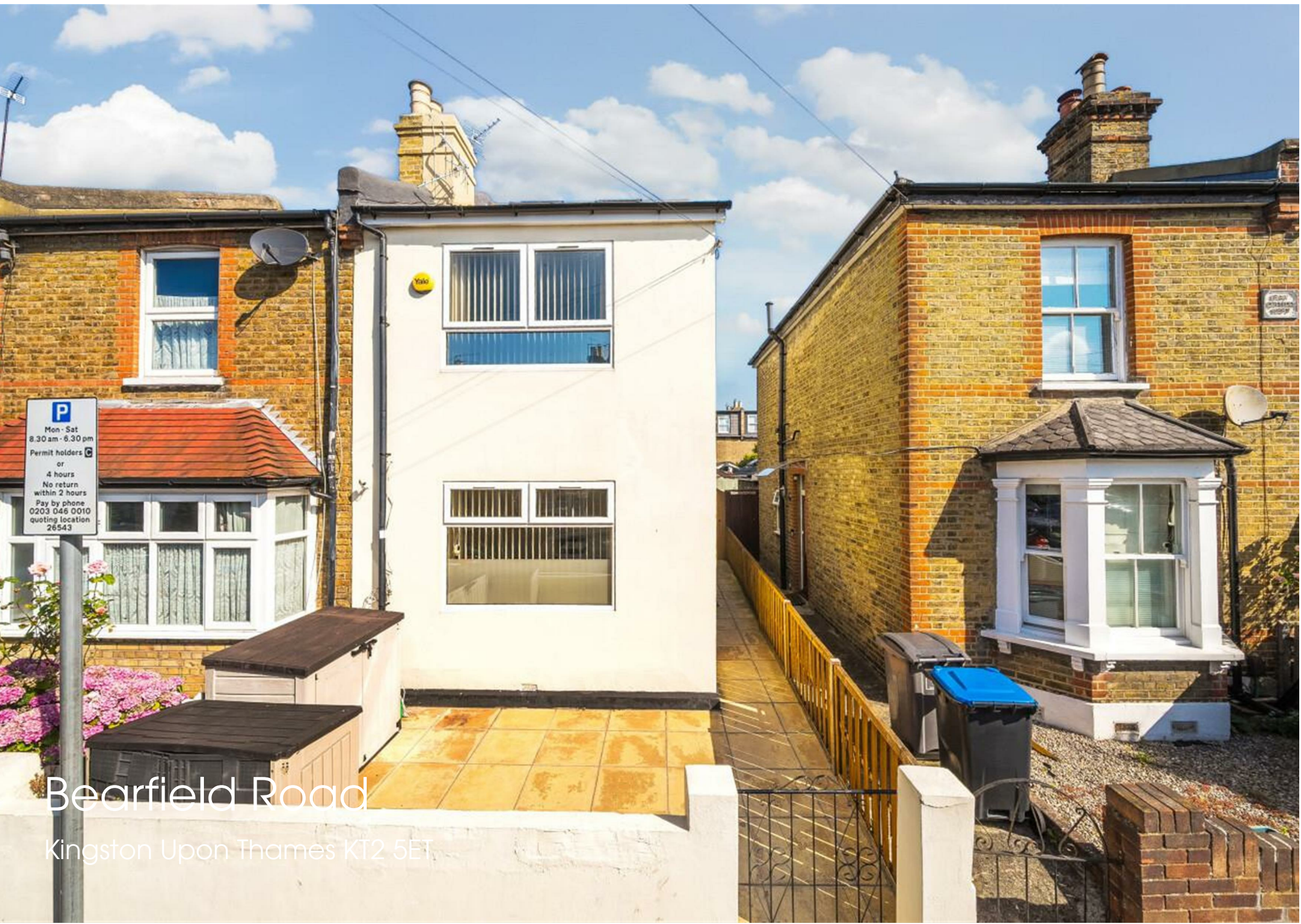
Bearfield Road Kingston Upon Thames KT2 5ET

34 Richmond Road Kingston upon Thames Surrey KT2 5ED www.gibsonlane.co.uk Tel: 020 8546 5444