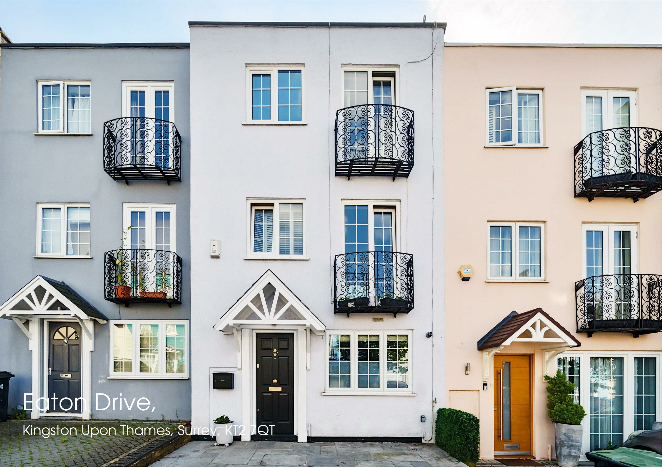
Eaton Drive, Kingston Upon Thames, Surrey, KT2 7QT