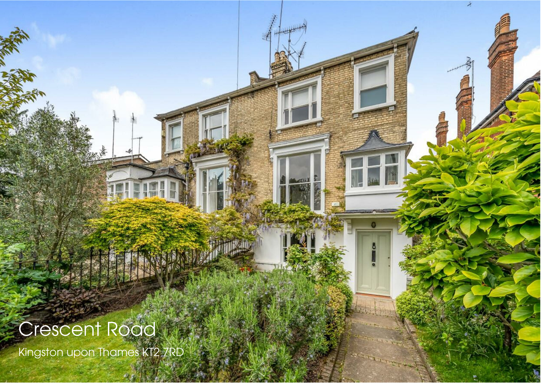
Crescent Road Kingston upon Thames KT2 7RD