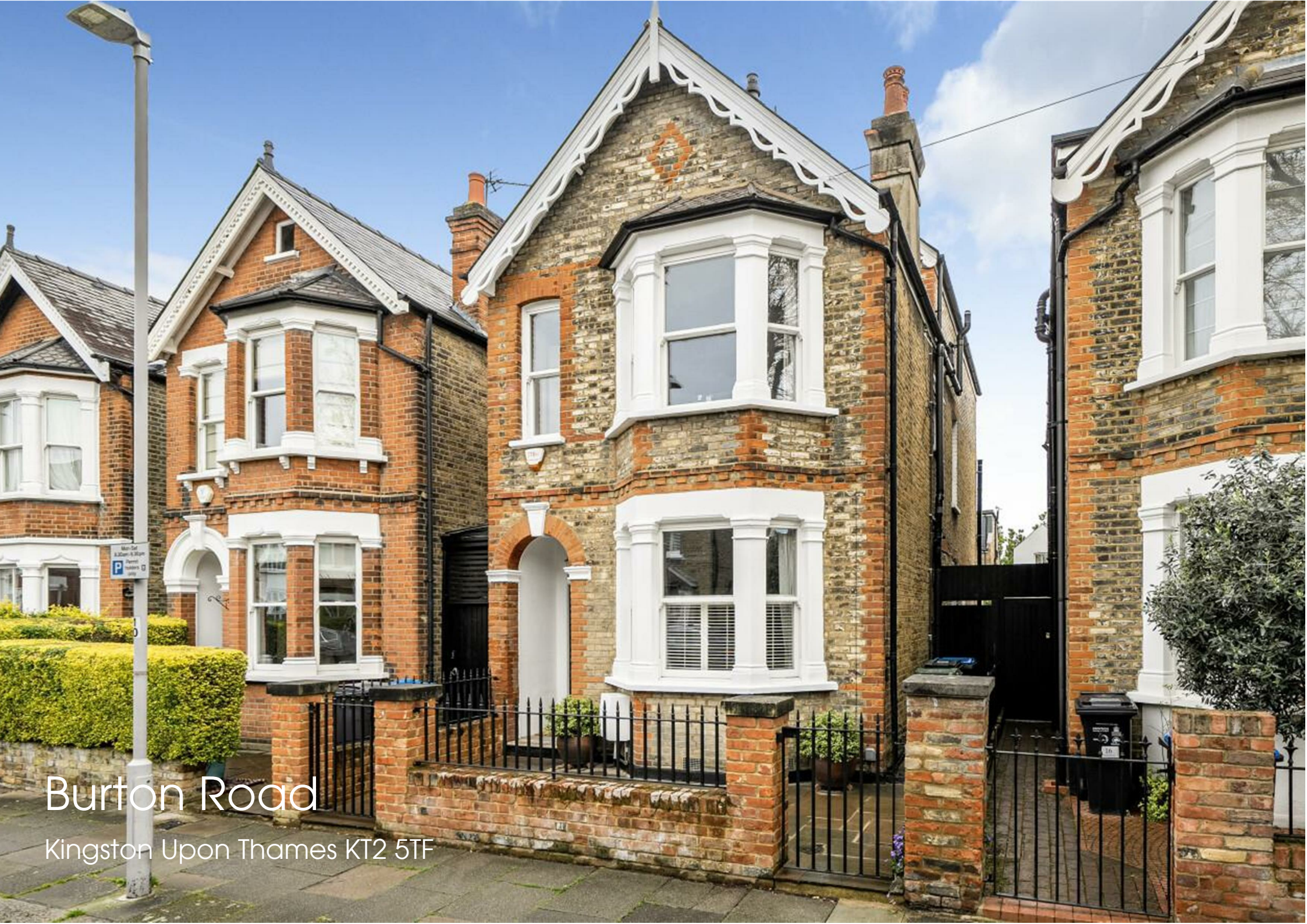
Burton Road Kingston Upon Thames KT2 5TF

34 Richmond Road Kingston upon Thames Surrey KT2 5ED www.gibsonlane.co.uk Tel: 020 8546 5444