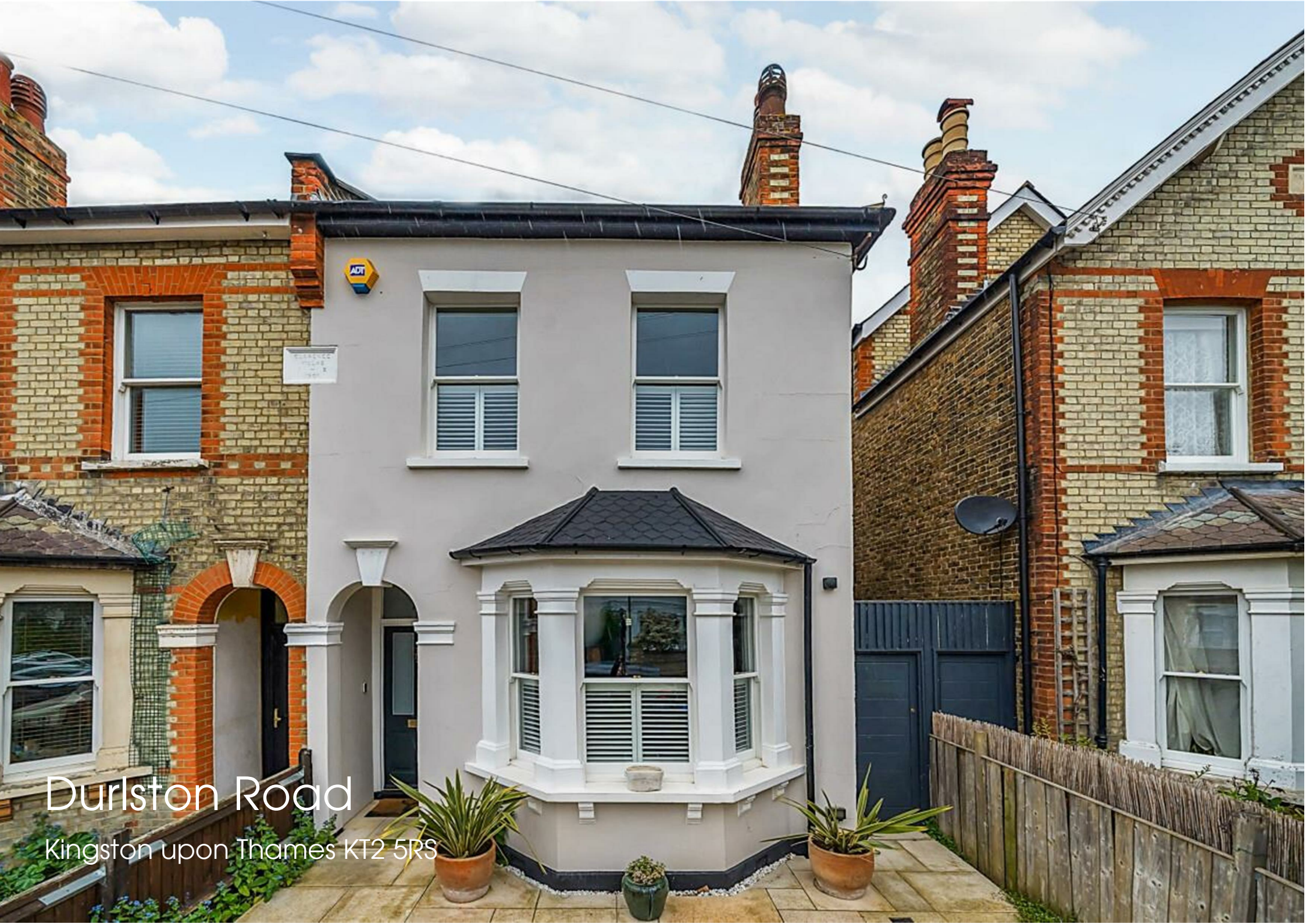
Durlston Road Kingston upon Thames KT2 5RS

34 Richmond Road Kingston upon Thames Surrey KT2 5ED www.gibsonlane.co.uk Tel: 020 8546 5444