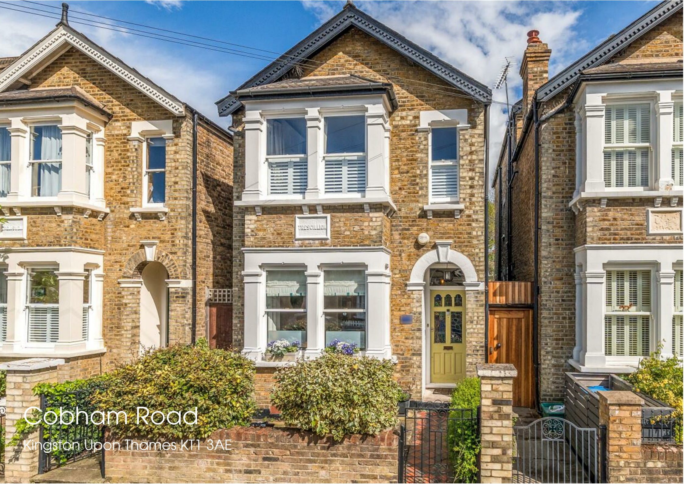
Cobham Road Kingston Upon Thames KT1 3AE

34 Richmond Road Kingston upon Thames Surrey KT2 5ED www.gibsonlane.co.uk Tel: 020 8546 5444