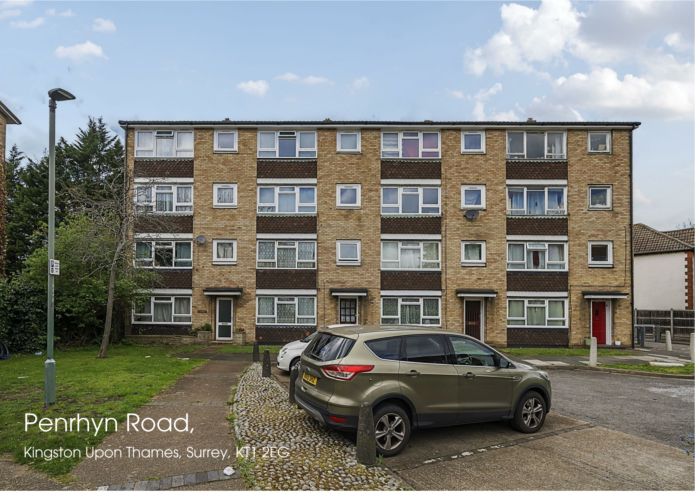
Penrhyn Road, Kingston Upon Thames, Surrey, KT1 2EG