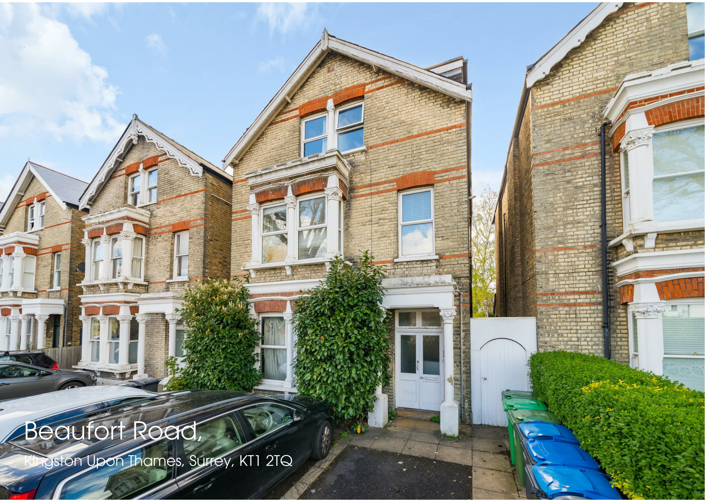
Beaufort Road, Kingston Upon Thames, Surrey, KT1 2TQ