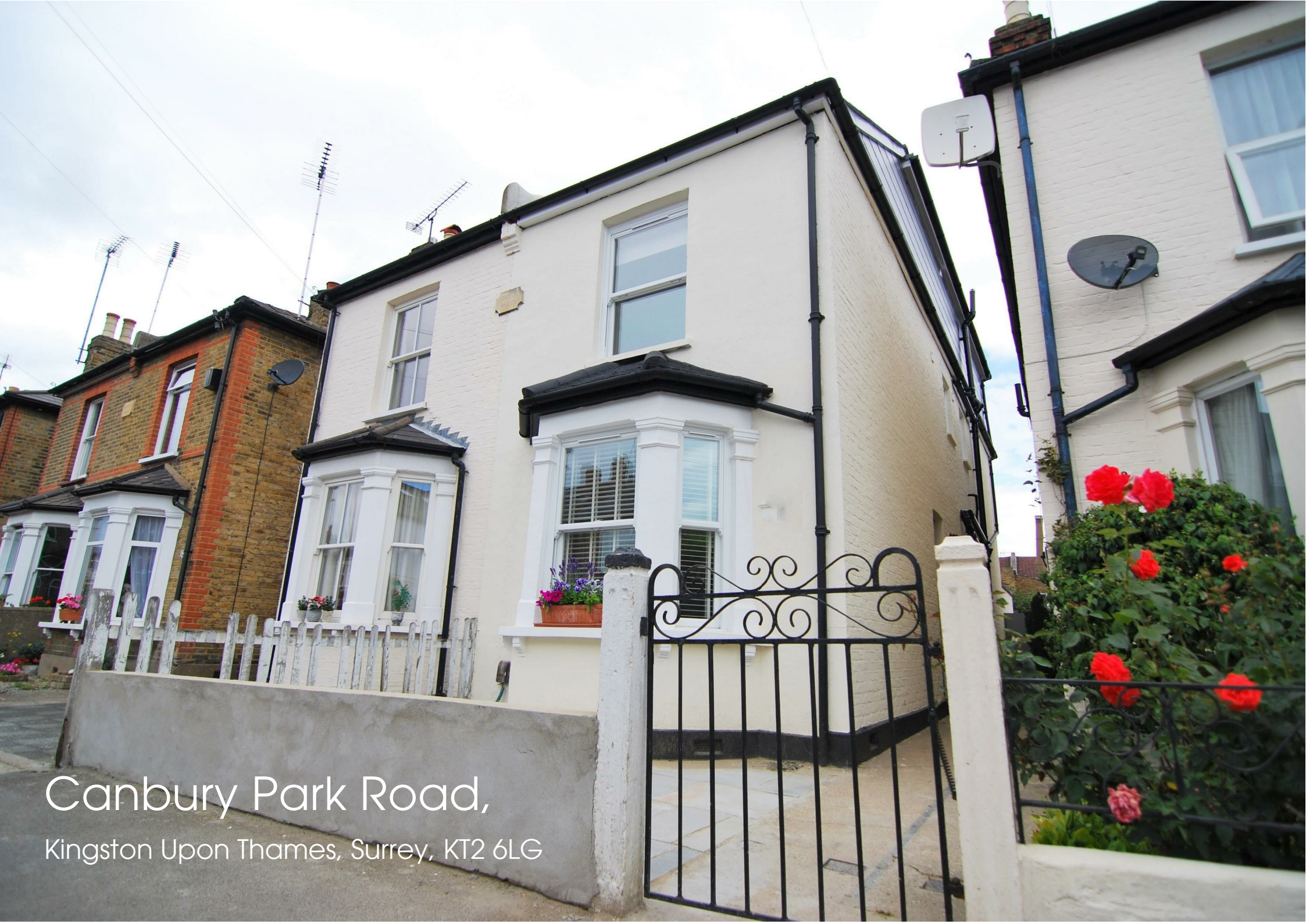
Canbury Park Road, Kingston Upon Thames, Surrey, KT2 6LG