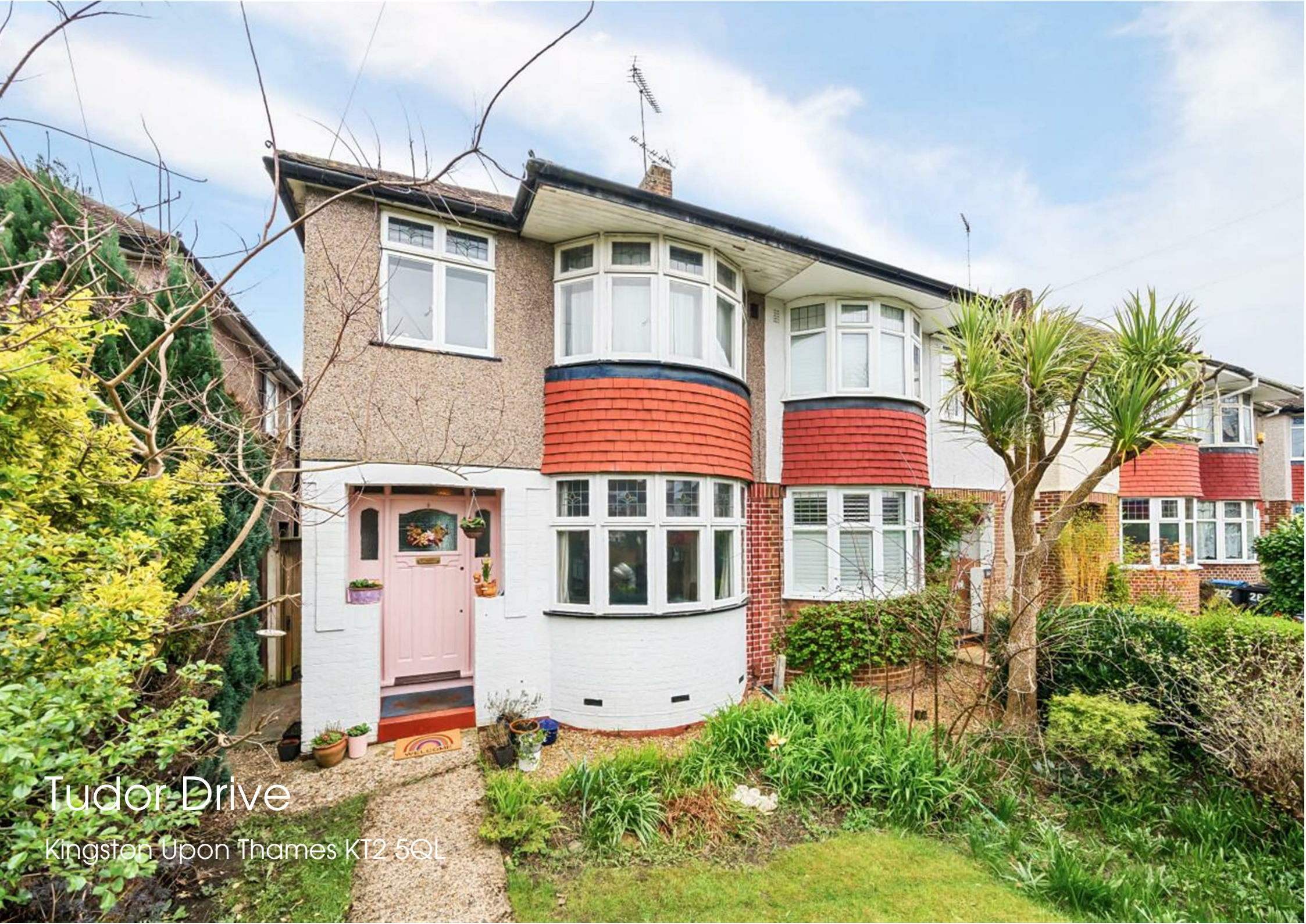
Tudor Drive Kingston Upon Thames KT2 5QL