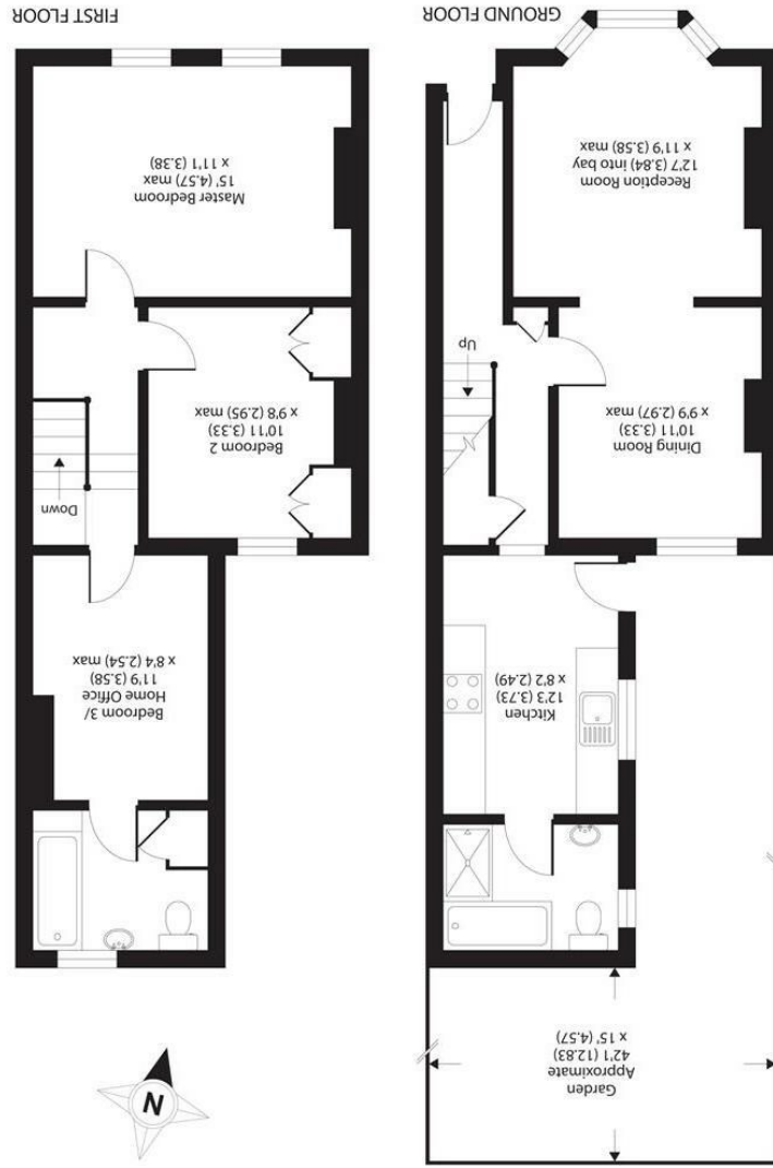
APPROX GROSS INTERNAL FLOOR AREA 1014 SQ FT 94.2 SQ METRES

34 Richmond Road Kingston upon Thames Surrey KT2 5ED www.gibsonlane.co.uk Tel: 020 8546 5444