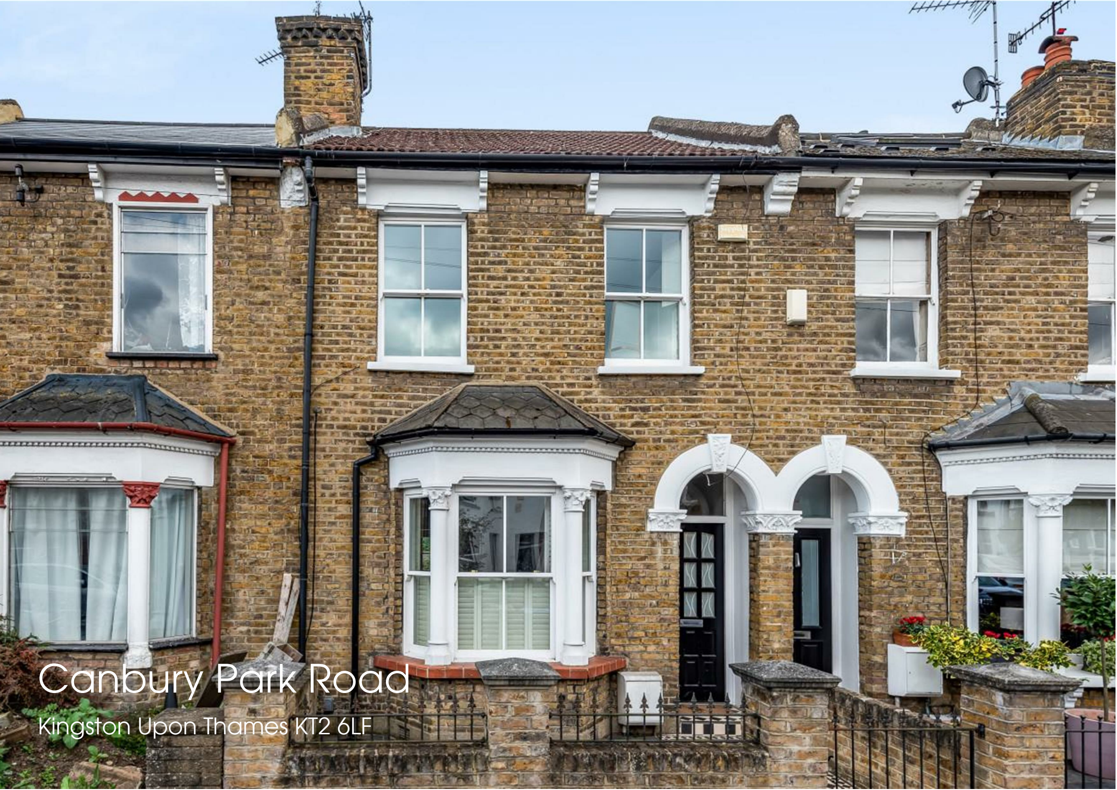
Canbury Park Road Kingston Upon Thames KT2 6LF