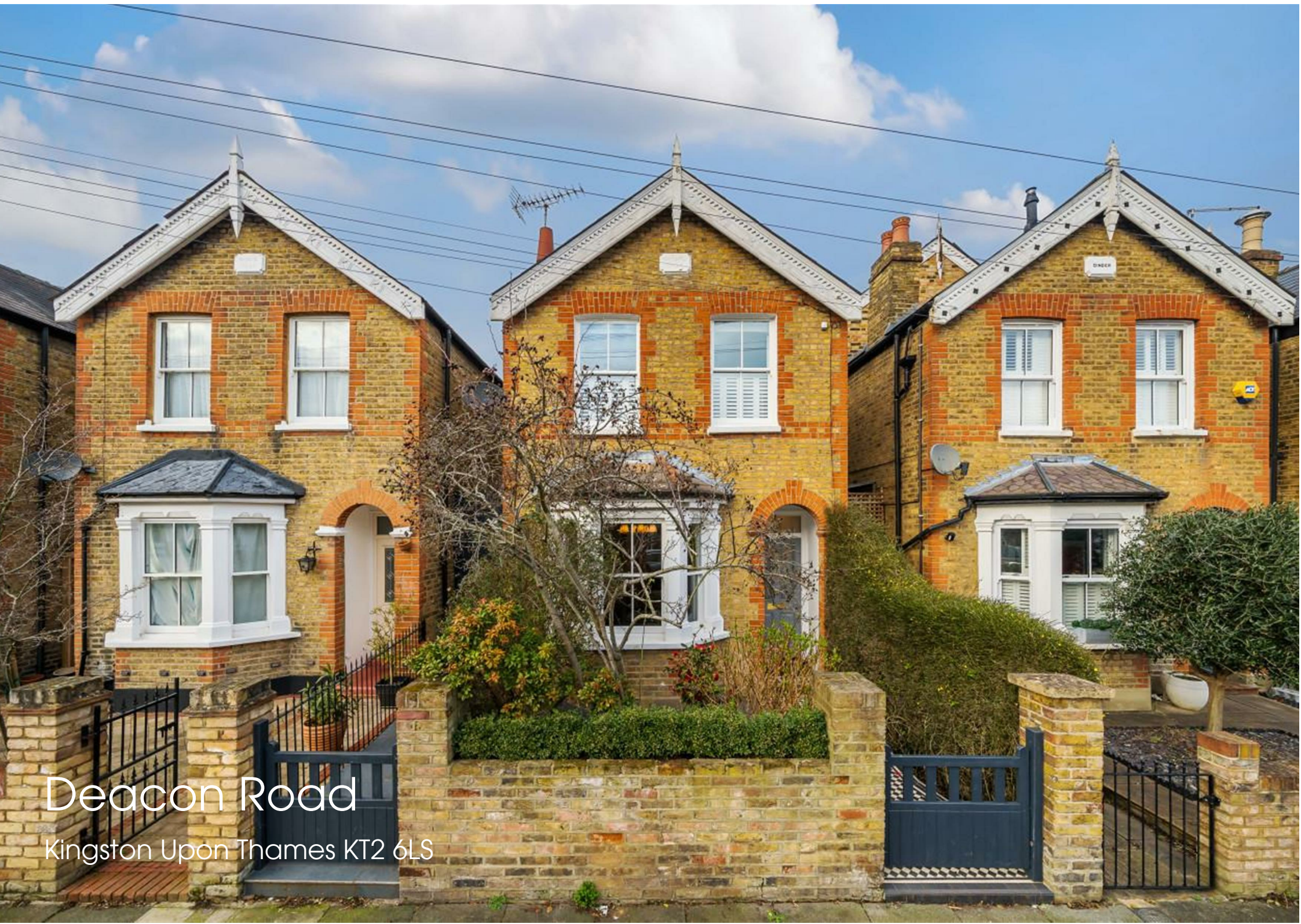
Deacon Road Kingston Upon Thames KT2 6LS