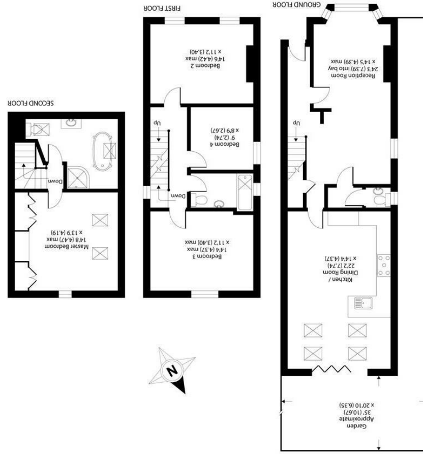
APPROX GROSS INTERNAL FLOOR AREA 1600 SQ FT 148.6 SQ METRES

34 Richmond Road Kingston upon Thames Surrey KT2 5ED www.gibsonlane.co.uk Tel: 020 8546 5444