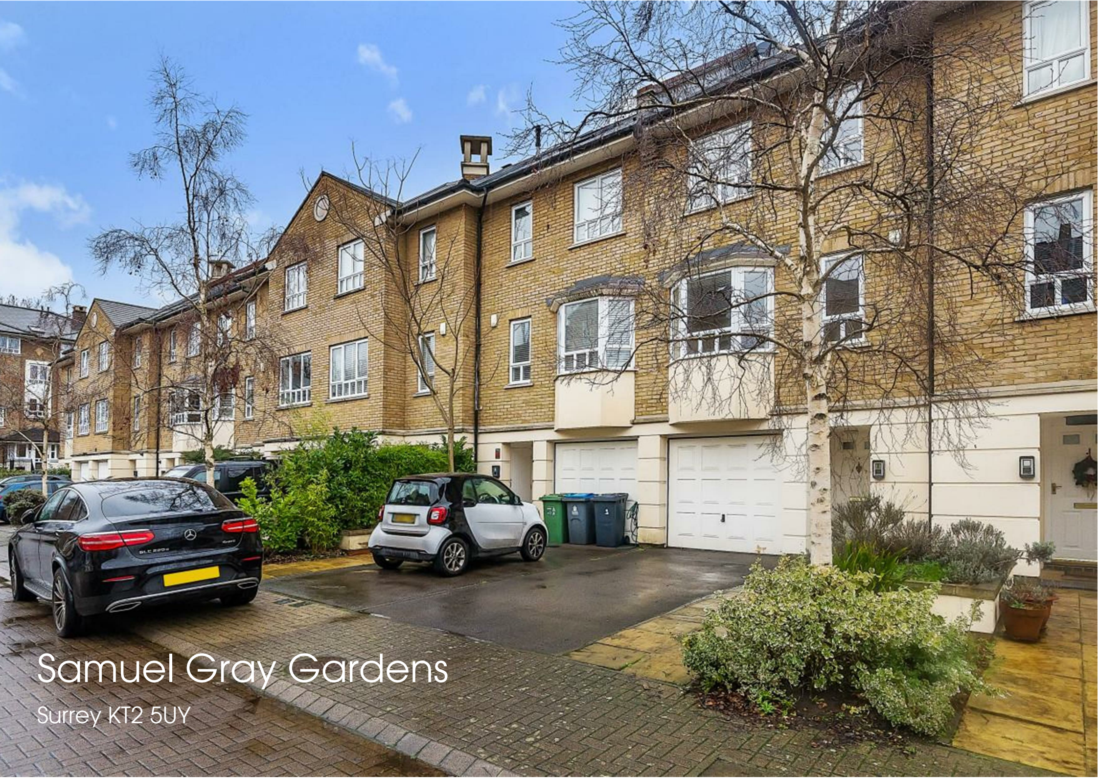
Samuel Gray Gardens Surrey KT2 5UY

34 Richmond Road Kingston upon Thames Surrey KT2 5ED www.gibsonlane.co.uk Tel: 020 8546 5444