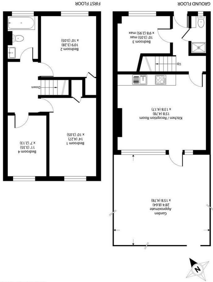
Approximate Area = 850 sq ft / 79 sq m For identification only - Not to scale

RICS Property Measurement Floor plan produced in accordance with RICS Property Measurement Standards incorporating International Property Measurement Standards (IPMS) (Revision 2022) Produced for Gibson Lane, REF: 822269