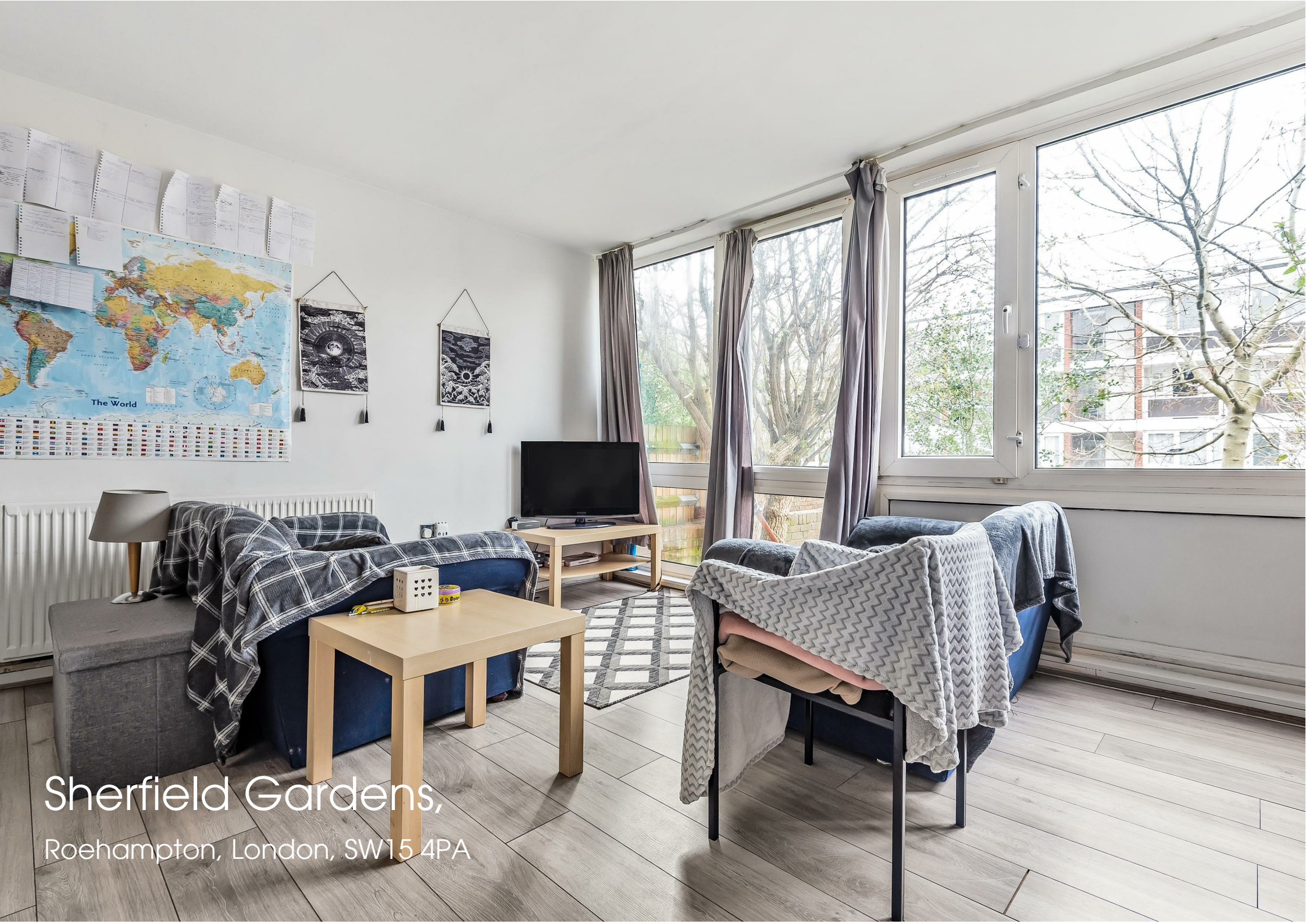
Sherfield Gardens, Roehampton, London, SW15 4PA