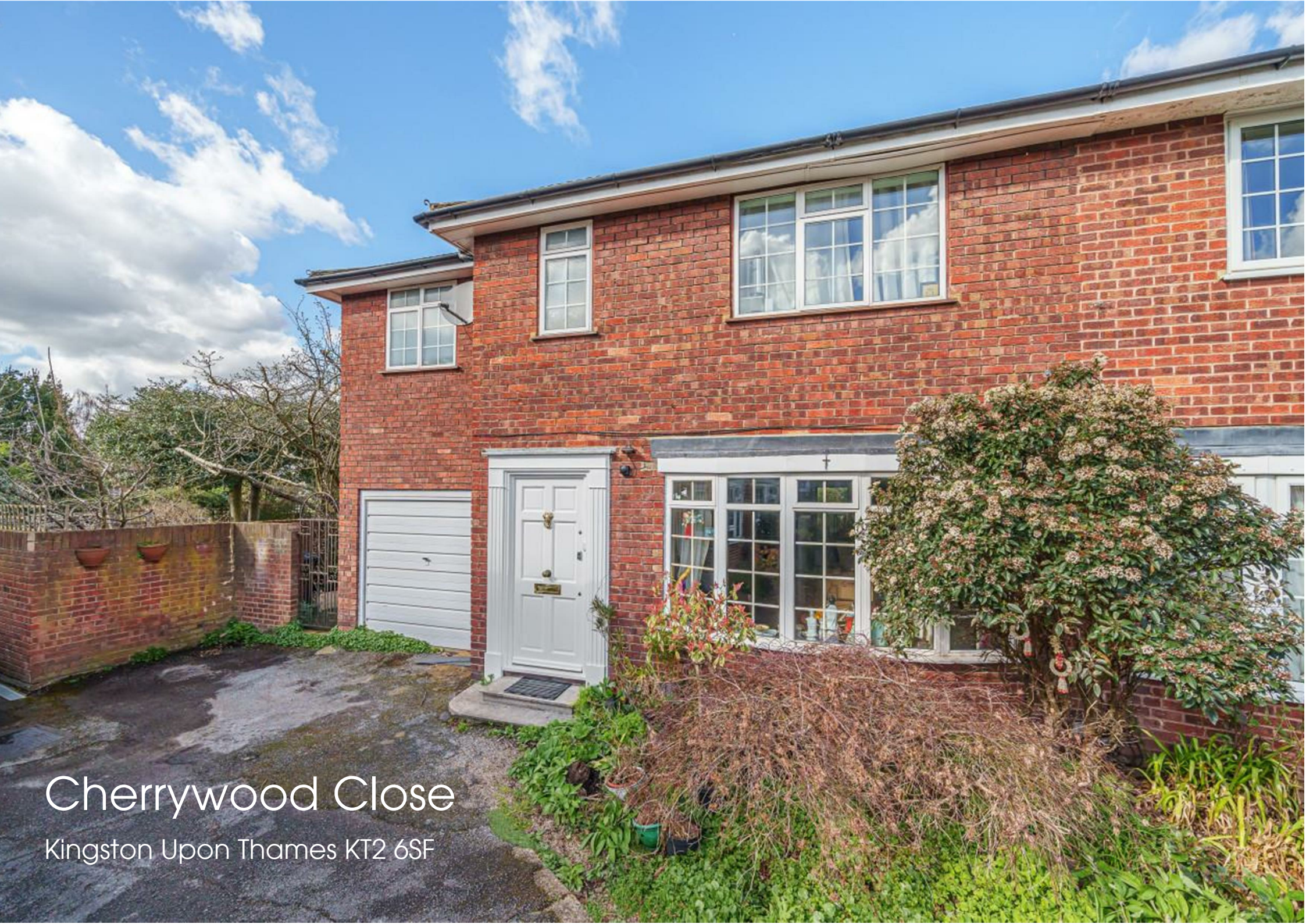
Cherrywood Close Kingston Upon Thames KT2 6SF

34 Richmond Road Kingston upon Thames Surrey KT2 6ED www.gibsonlane.co.uk Tel: 020 8546 5444