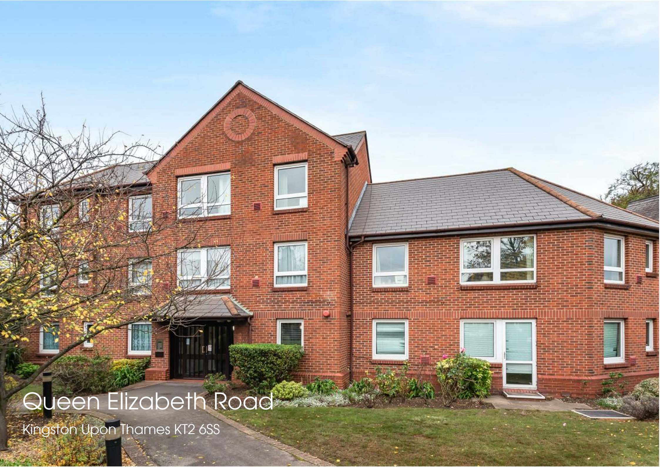
Queen Elizabeth Road Kingston Upon Thames KT2 6SS