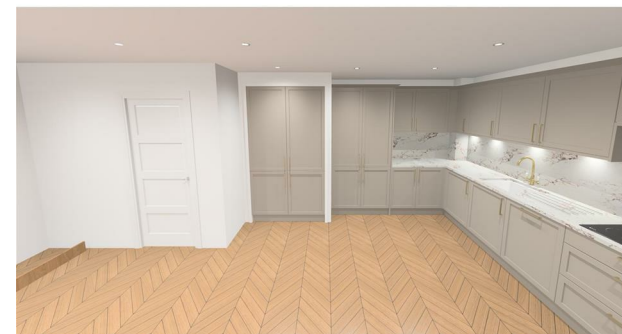
3, Churchdale, Aldershot Road, Church Crookham, Fleet, GU52 8JT All measurements are approximate and for display purposes only