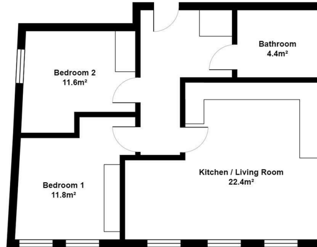
Total Area: 658 ft² ... 61.2 m² All measurements are approximate and for display purposes only