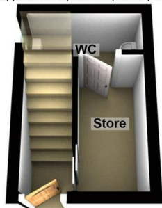
Ground Floor Approx. 7.3 sq. metres (78.9 sq. feet)