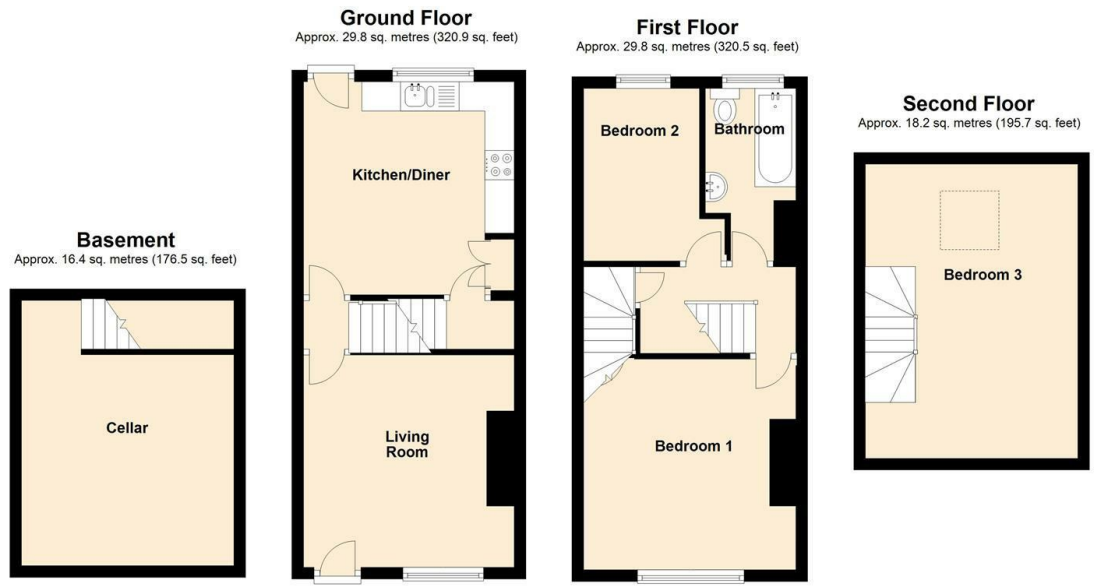
Total area: approx. 94.2 sq. metres (1013.6 sq. feet) Whilst every care has been taken to prepare these floor plans, they are for guidance purposes only. Plan produced using PlanUp.