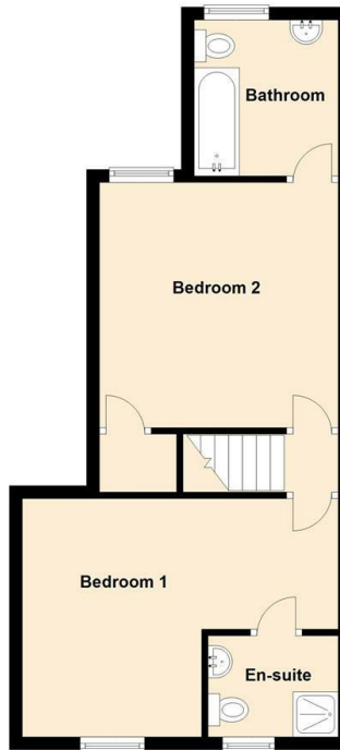
Total area: approx. 79.5 sq. metres (856.2 sq. feet) Whilst every care has been taken to prepare these floor plans, they are for guidance purposes only. Plan produced using PlanUp.