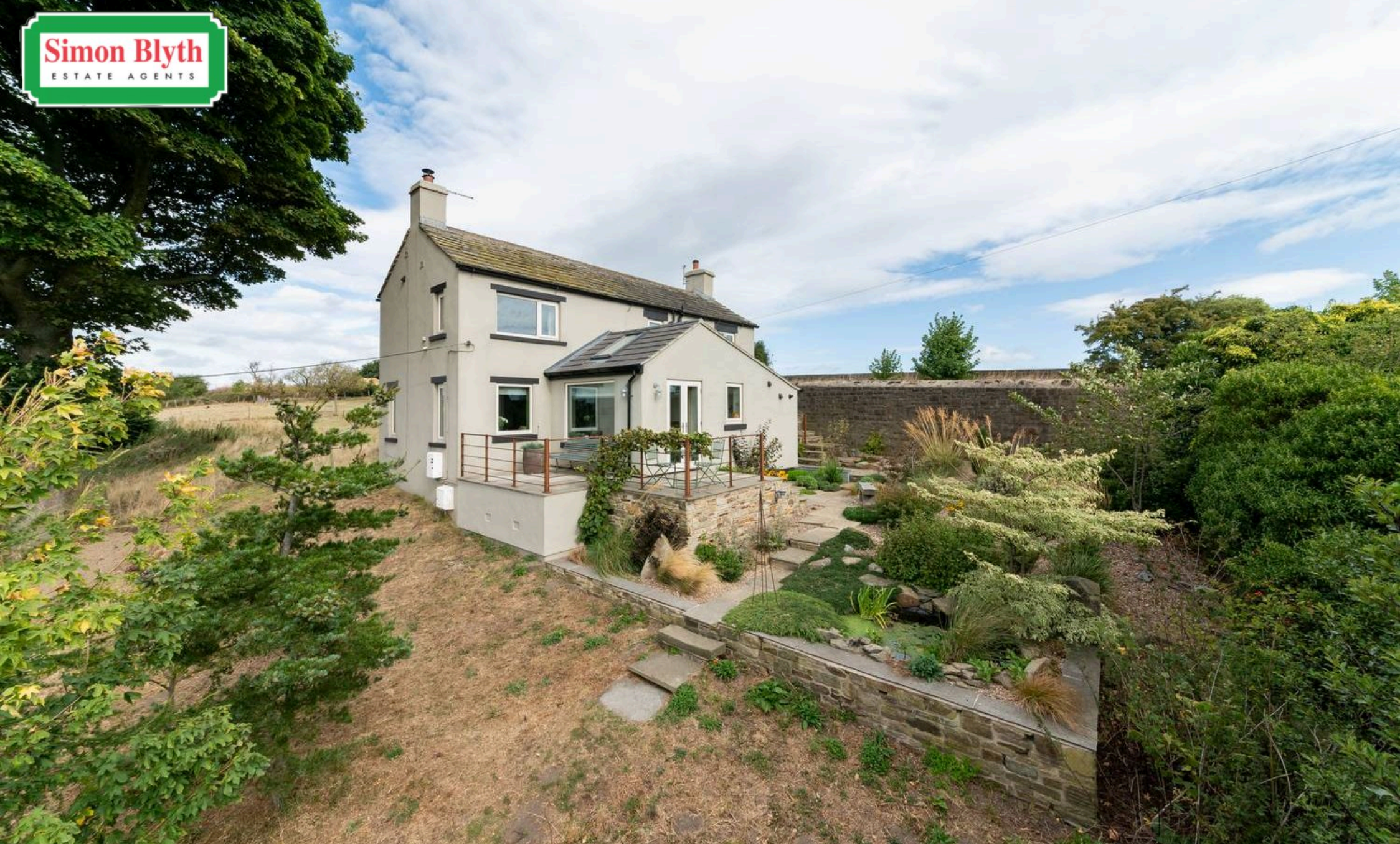
Copster, Copster Lane, Oxspring Sheffield