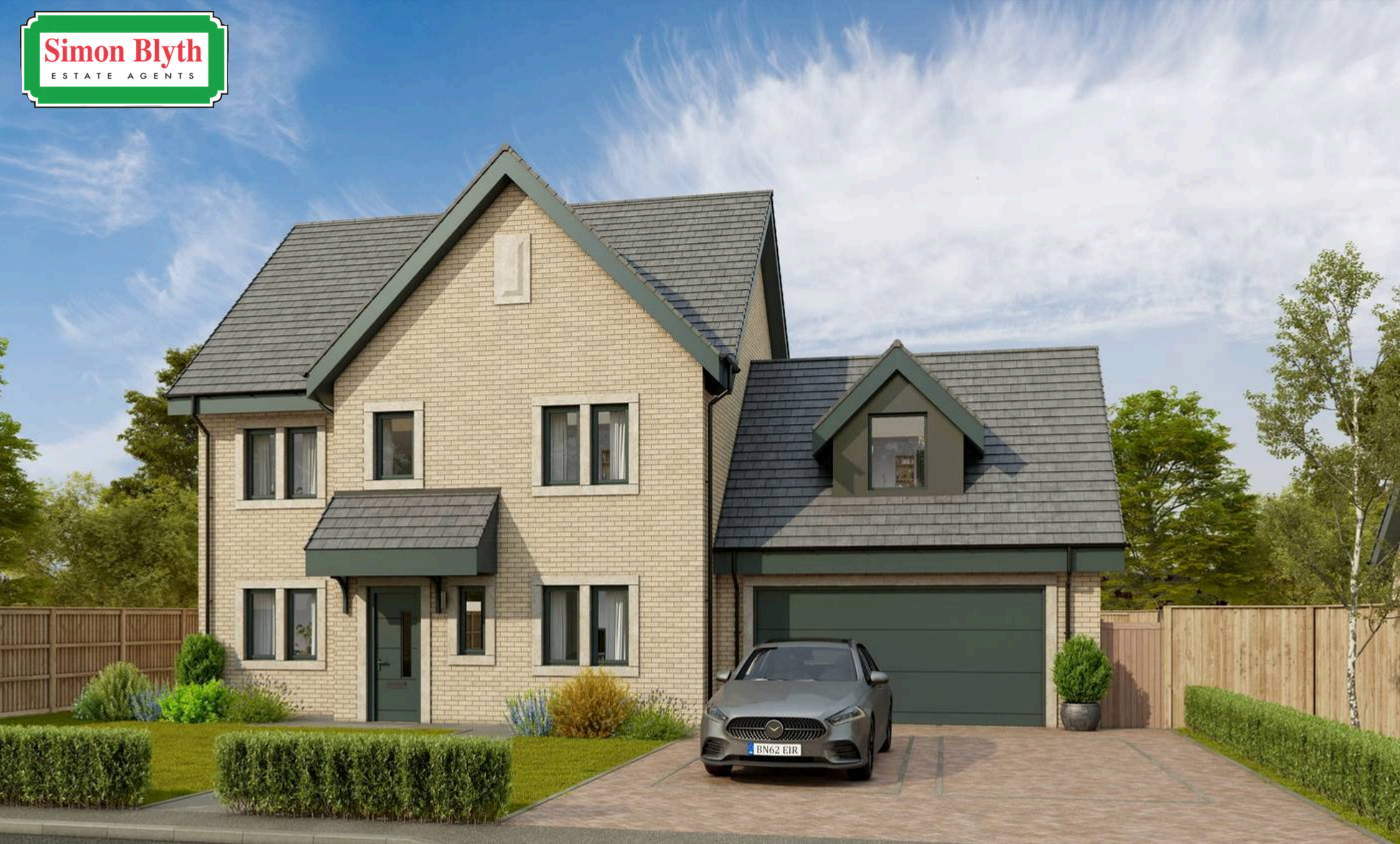
Plot 13, The Oak, Barley View, Roughbirchworth Lane, Oxspring Sheffield